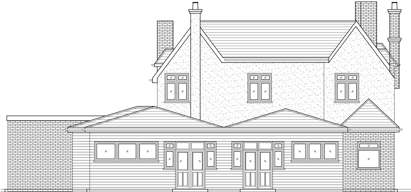
02- REAR ELEVATION