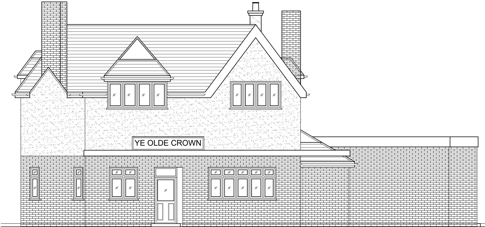
01- FRONT ELEVATION