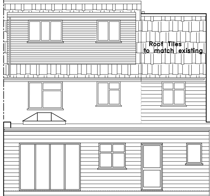
PROPOSED REAR ELEVATION (Side and Rear extension)