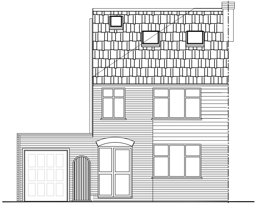
FRONT ELEVATION(loft under construction)