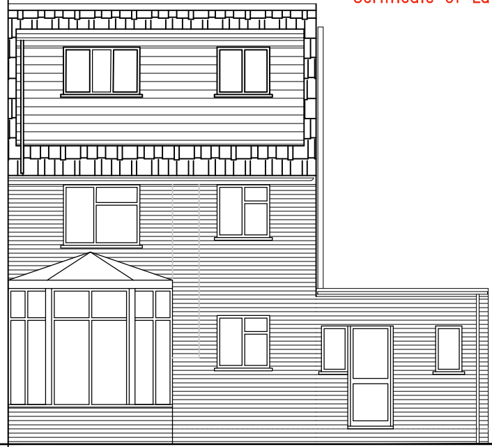
REAR ELEVATION(Loft under construction)

Loft under construction not part of This application approved under Certificate of Lawful use Ref:19887/APP/2022/318