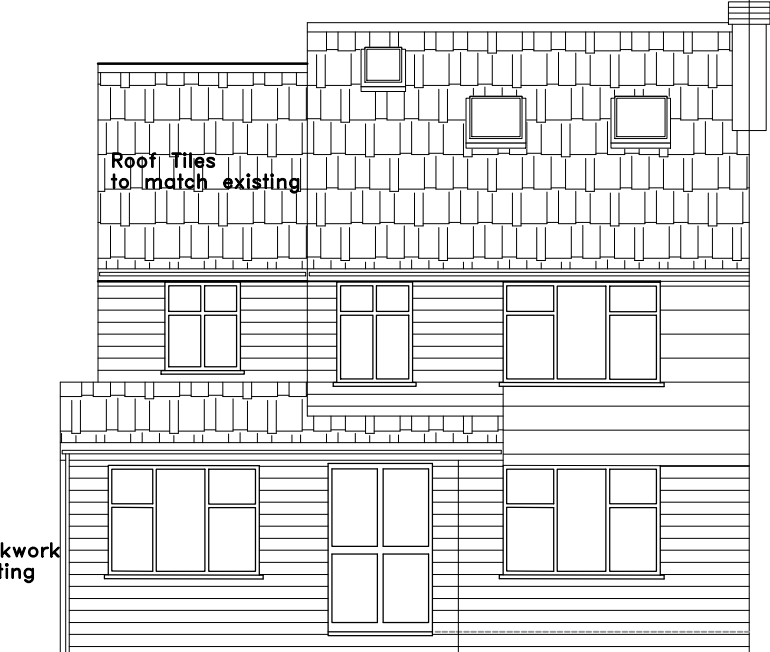
PROPOSED FRONT ELEVATION (Side and Rear extension)