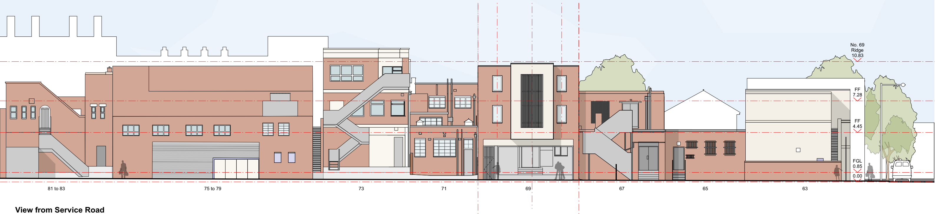
View from Service Road