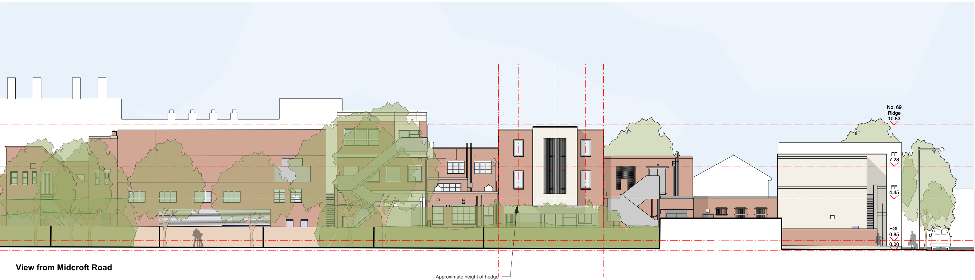
View from Midcroft Road