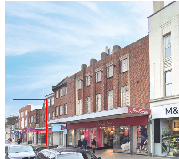
High Street Elevation 1:200

Building frontage extended to form second floor, in brick to match existing. Cornice detail to be replicated on the extended facade.