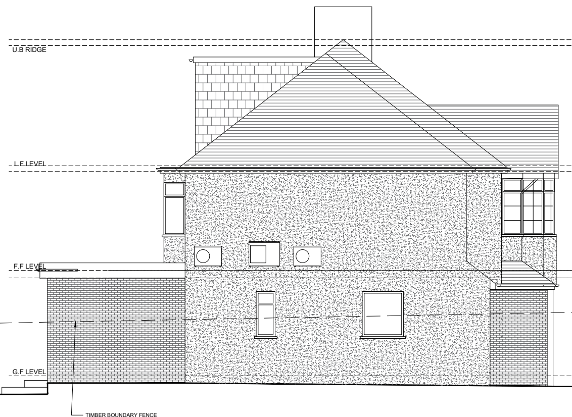
EXISTING LEFT SIDE ELEVATION