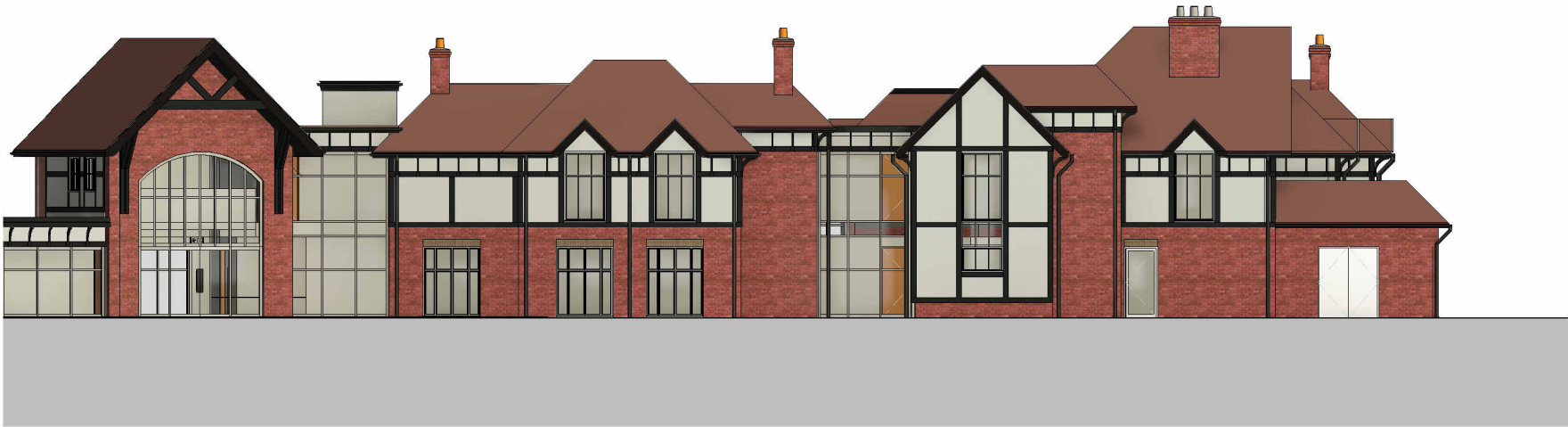
North West Elevation as Existing 1 : 200