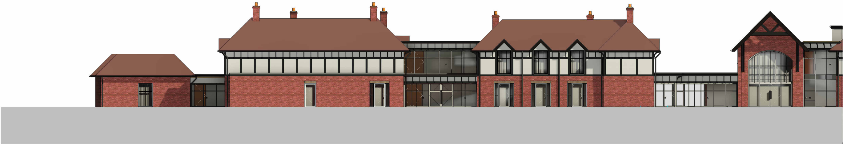
North Elevation as Existing 1 : 200