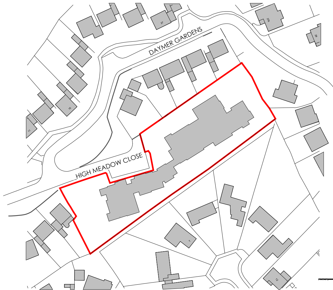
Block Plan as Existing (and as Proposed) 1 : 1250