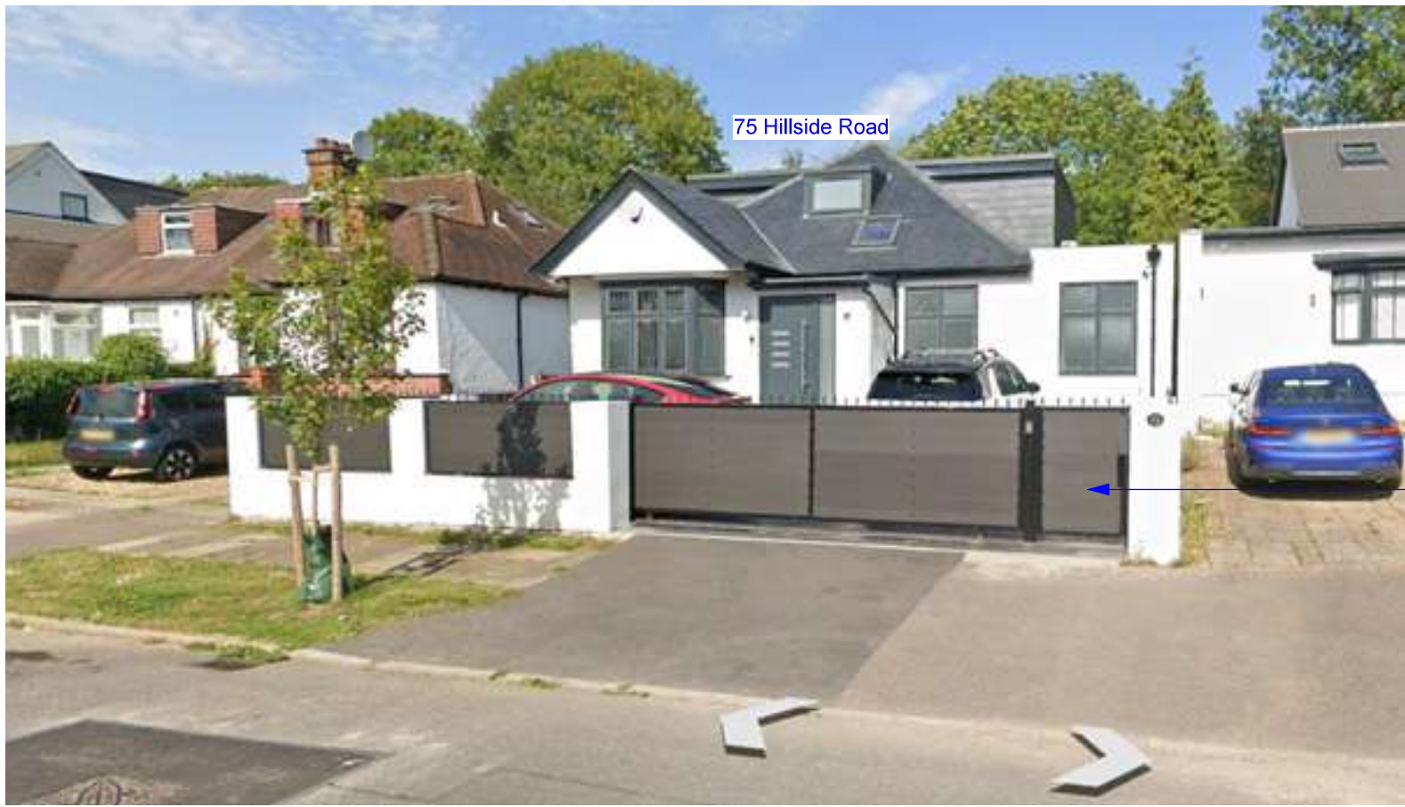
75 Hillside Road