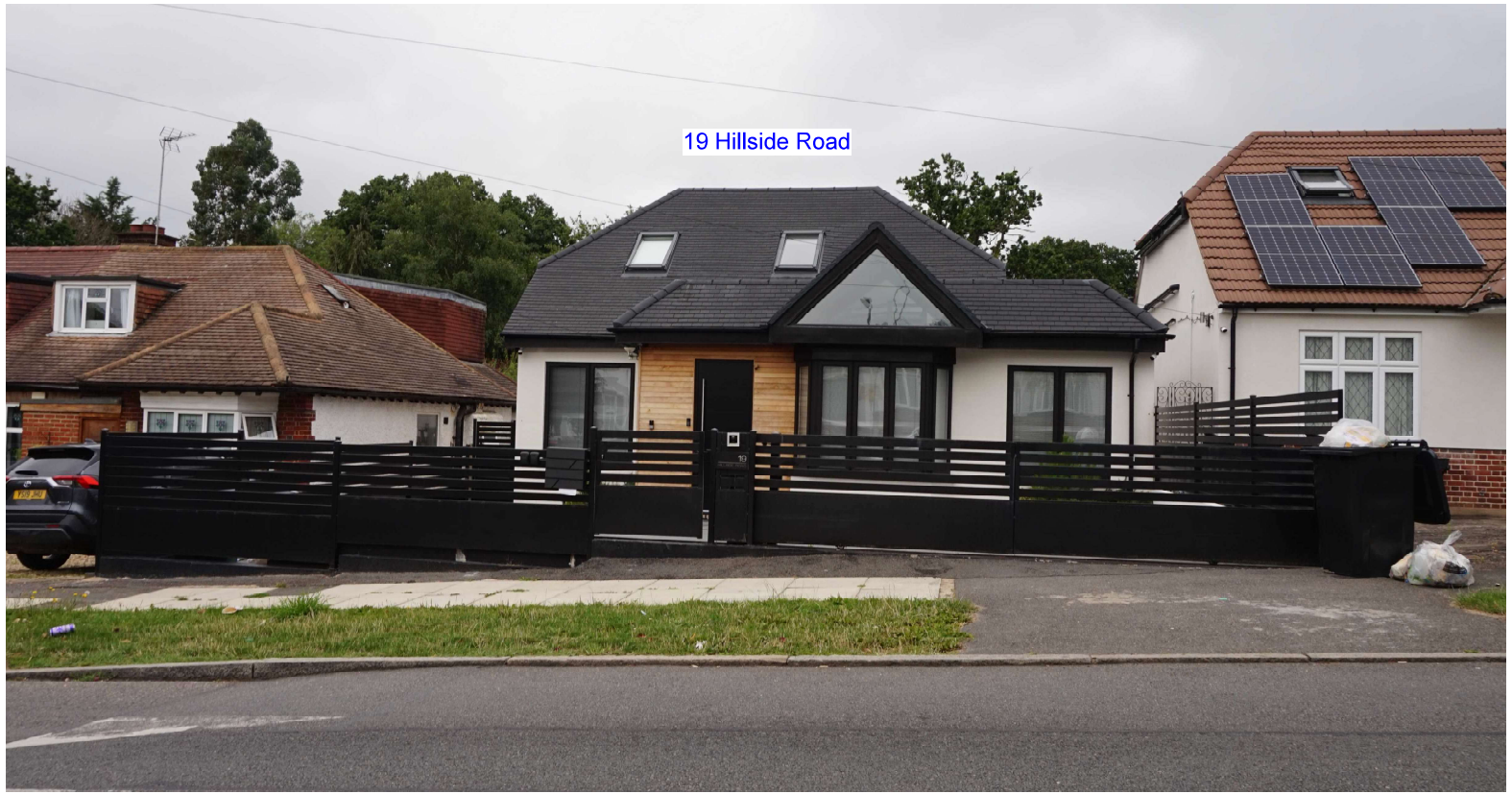
STREET VIEWS of property on same road showing boundary fence & gate