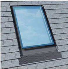
Slim line frame for pitched roof. Reset within roof tiles. Can be fixed to roof pitch as low as 12 deg. & as high as 90 deg.

Fixed in accordance with the manufacturers instructions.