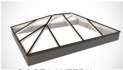
ROOF LANTERN over flat roof KORNICHE or similar slim line aluminium roof lantern

To be double glazed + to meet 'U' value of min. 2.0 W/m sq.K. All roof lights to be A-A fire rated.