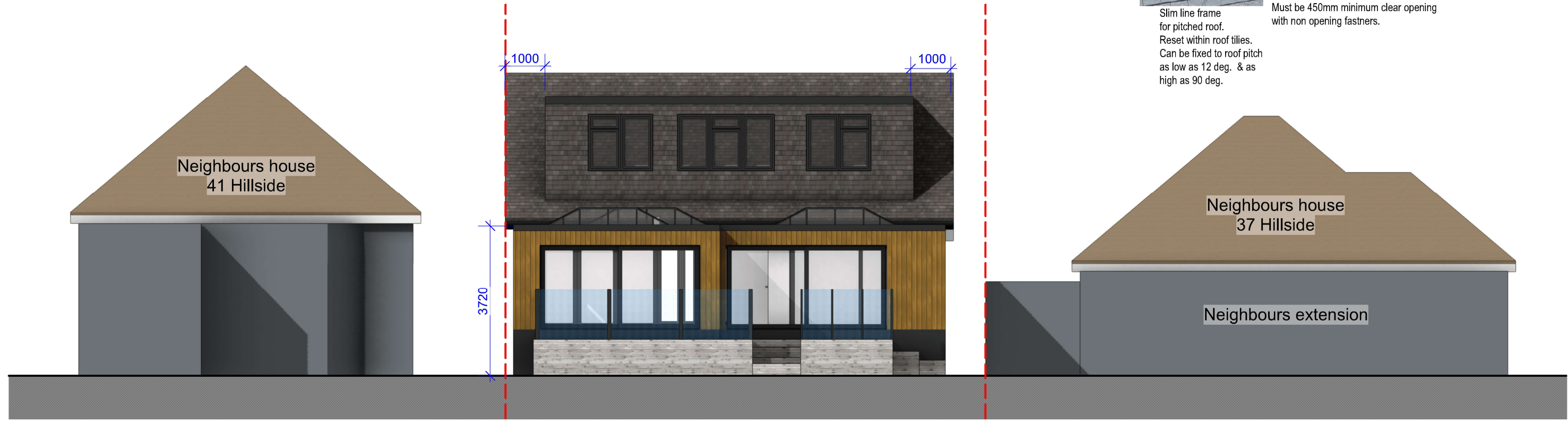
02 02 PROP ELEV REAR Scale: 1:100

Slim line frame for pitched roof. Reset within roof tiles. Can be fixed to roof pitch as low as 12 deg. & as high as 90 deg.