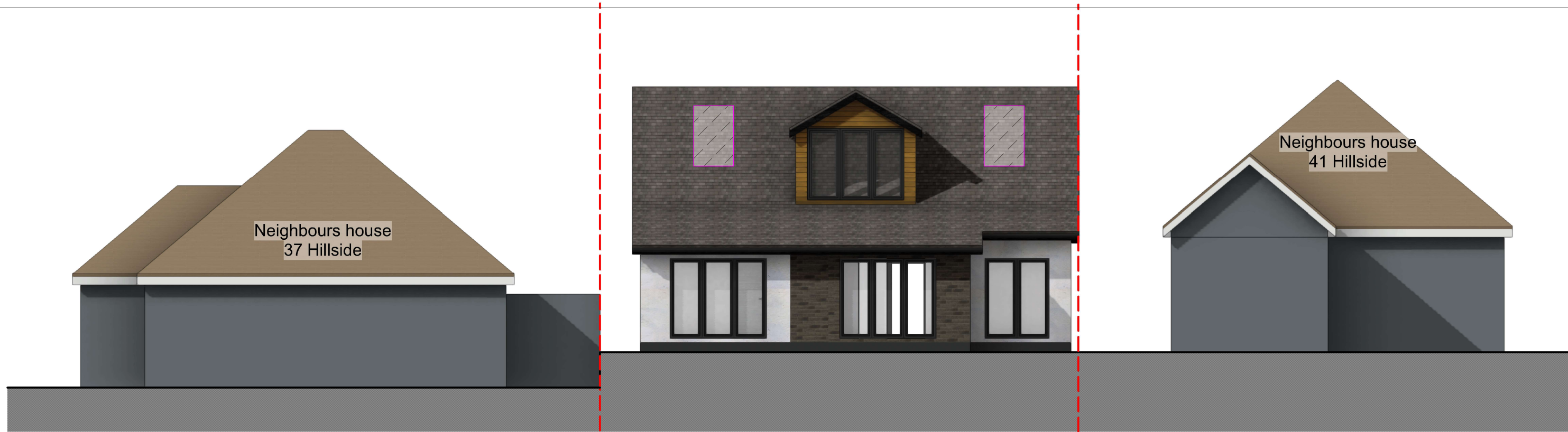
01 01 PROP ELEV FRONT Scale: 1:100