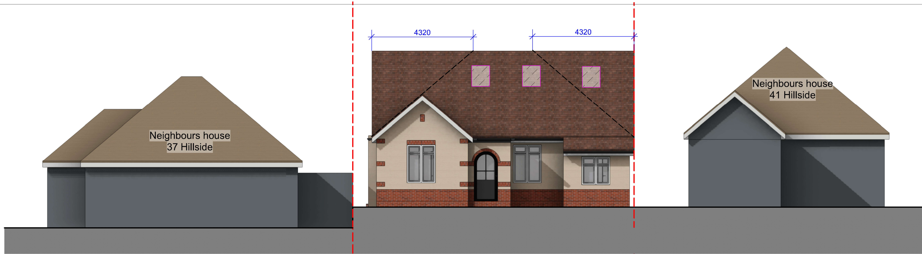
01 01 PROP ELEV FRONT Scale: 1:100