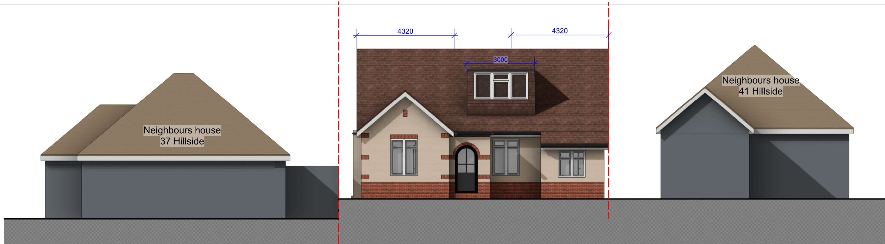
01 01 PROP ELEV FRONT Scale: 1:100