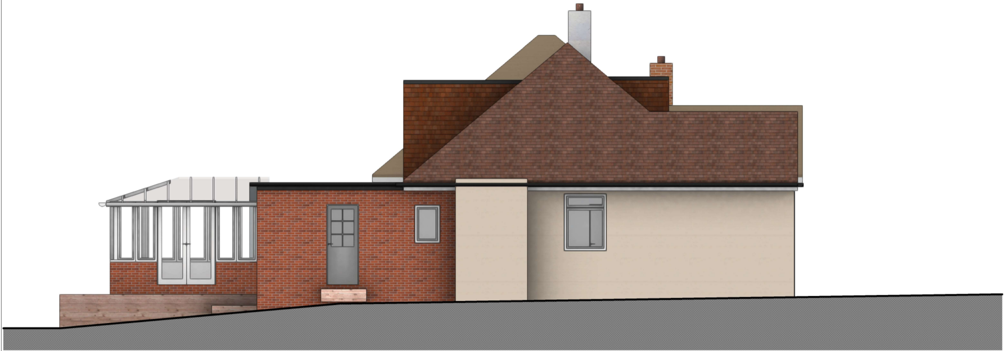
1 01 EXG ELEV SIDE Scale: 1:100