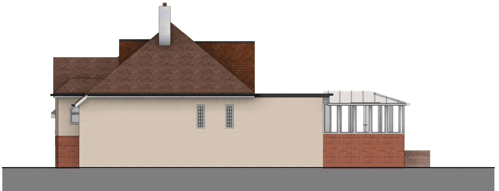
02 02 EXG ELEV SIDE Scale: 1:100