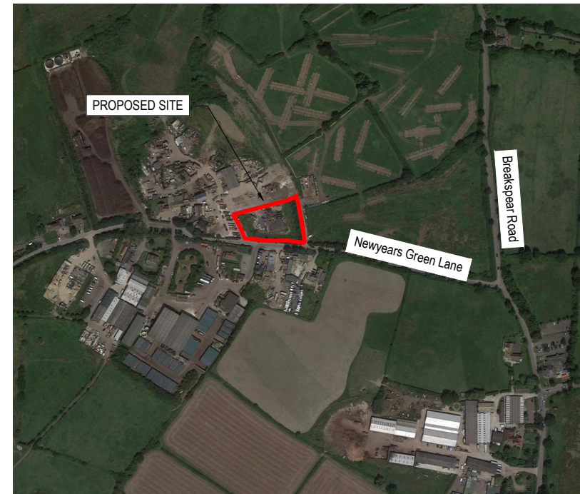
SITE LOCATION PLAN Scale 1:8000