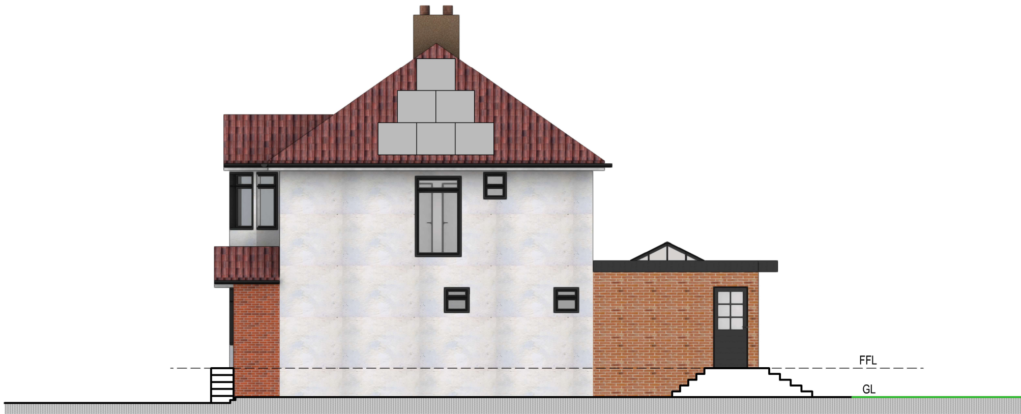
1 01 PROP ELEV SIDE Scale: 1:100