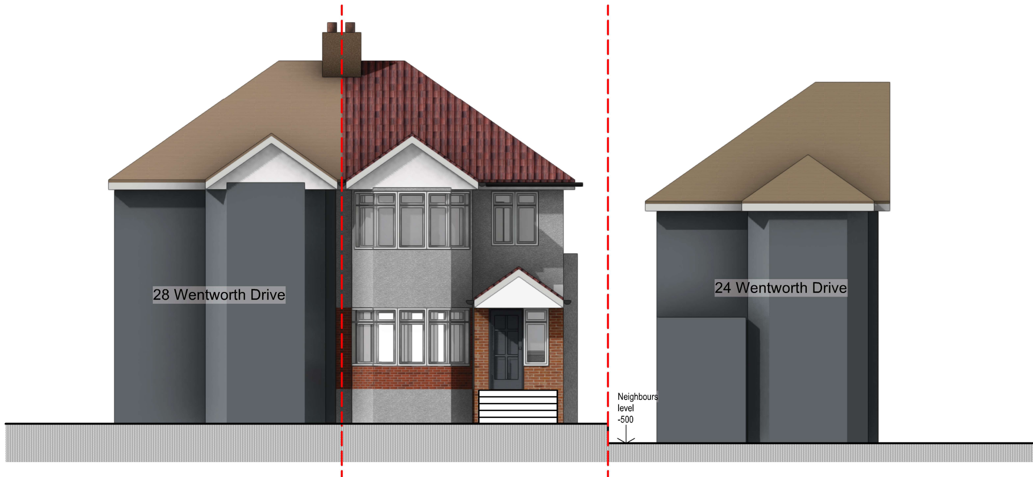
01 01 EXG ELEV FRONT Scale: 1:100