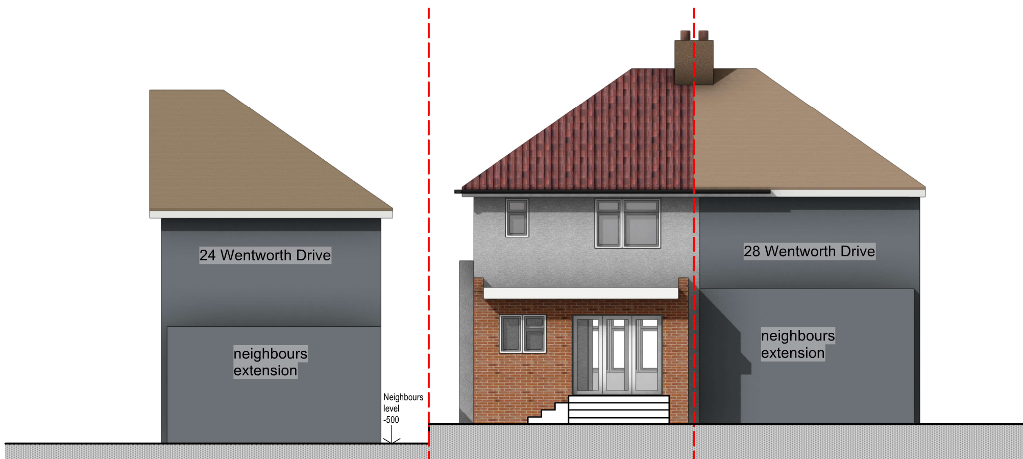
2 02 EXG ELEV REAR Scale: 1:100