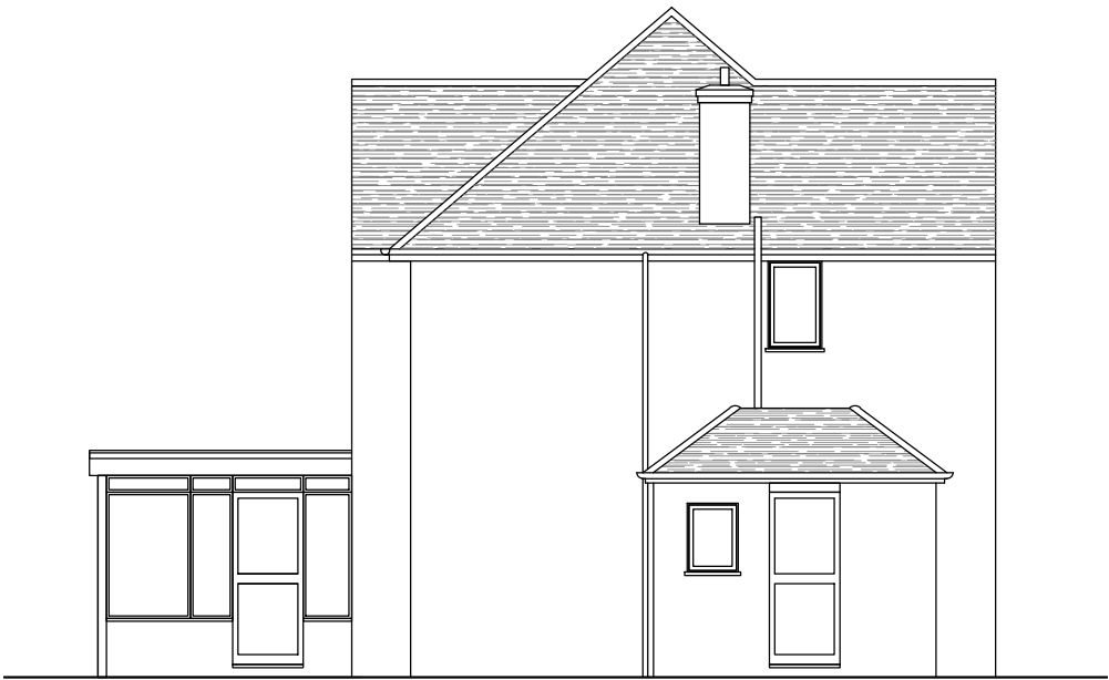
Existing Side Elevation Scale 1:100