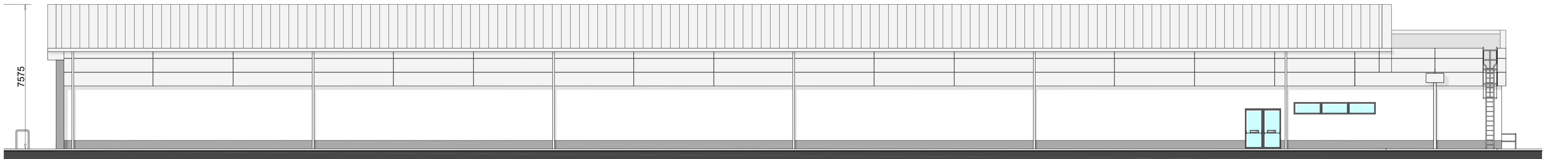
30.000 EAST ELEVATION