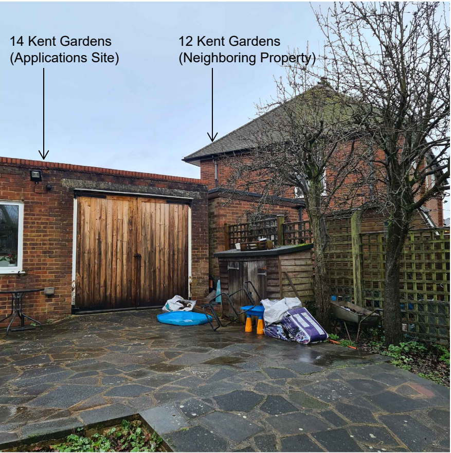
PHOTO OF REAR ELEVATION

COPYRIGHT: The contents of this drawing may not be reproduced in whole or in part without express written consent of Evolved Homes.