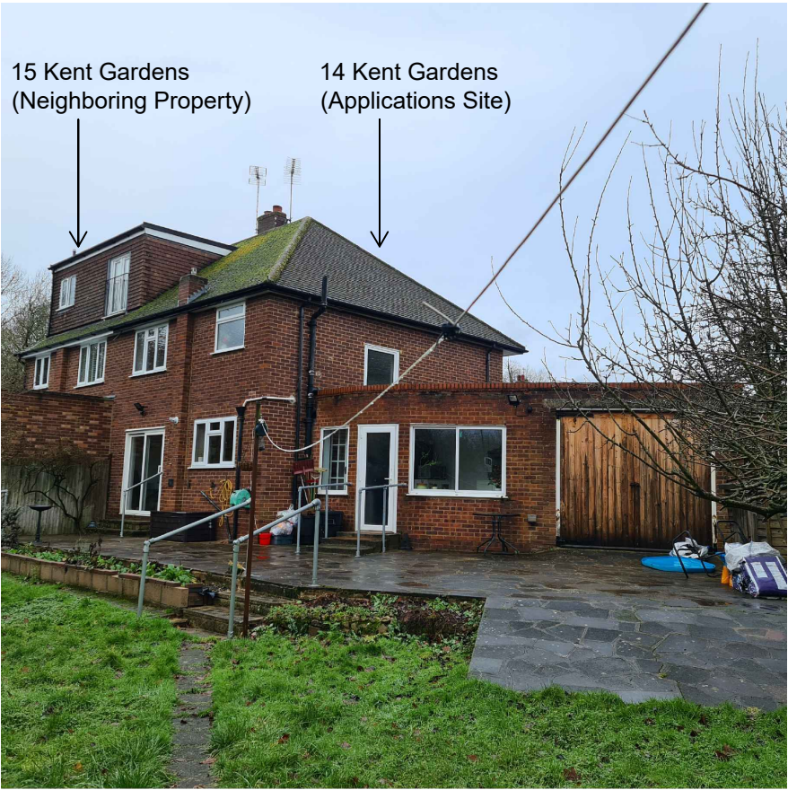
PHOTO OF REAR ELEVATION