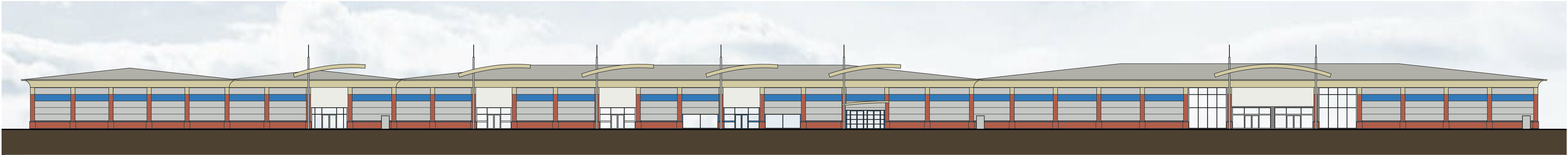
Existing East Elevation Scale 1:300