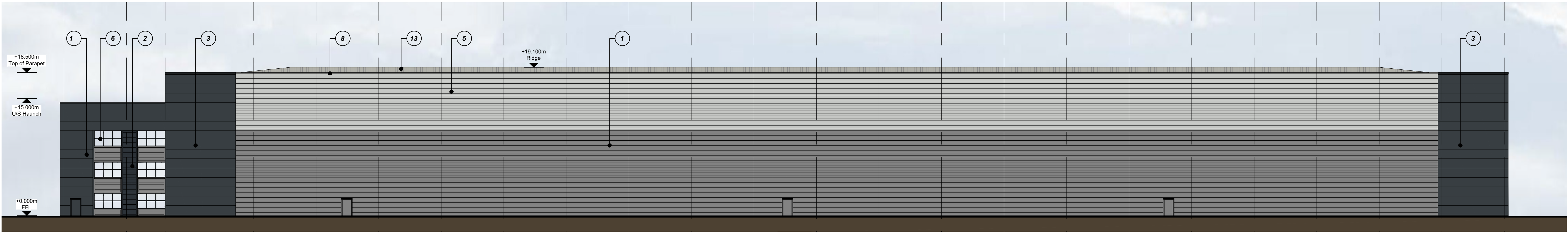
Proposed West Elevation Scale 1:250