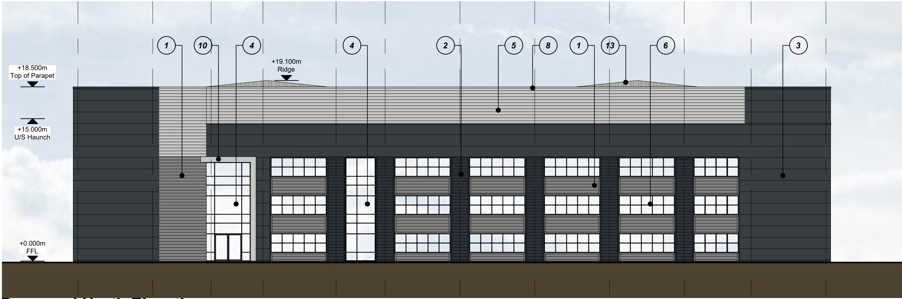
Proposed North Elevation Scale 1:250