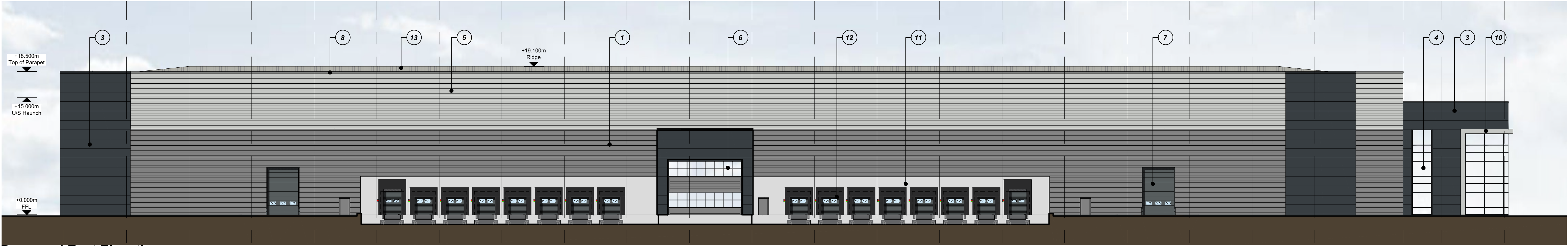
Proposed East Elevation Scale 1:250