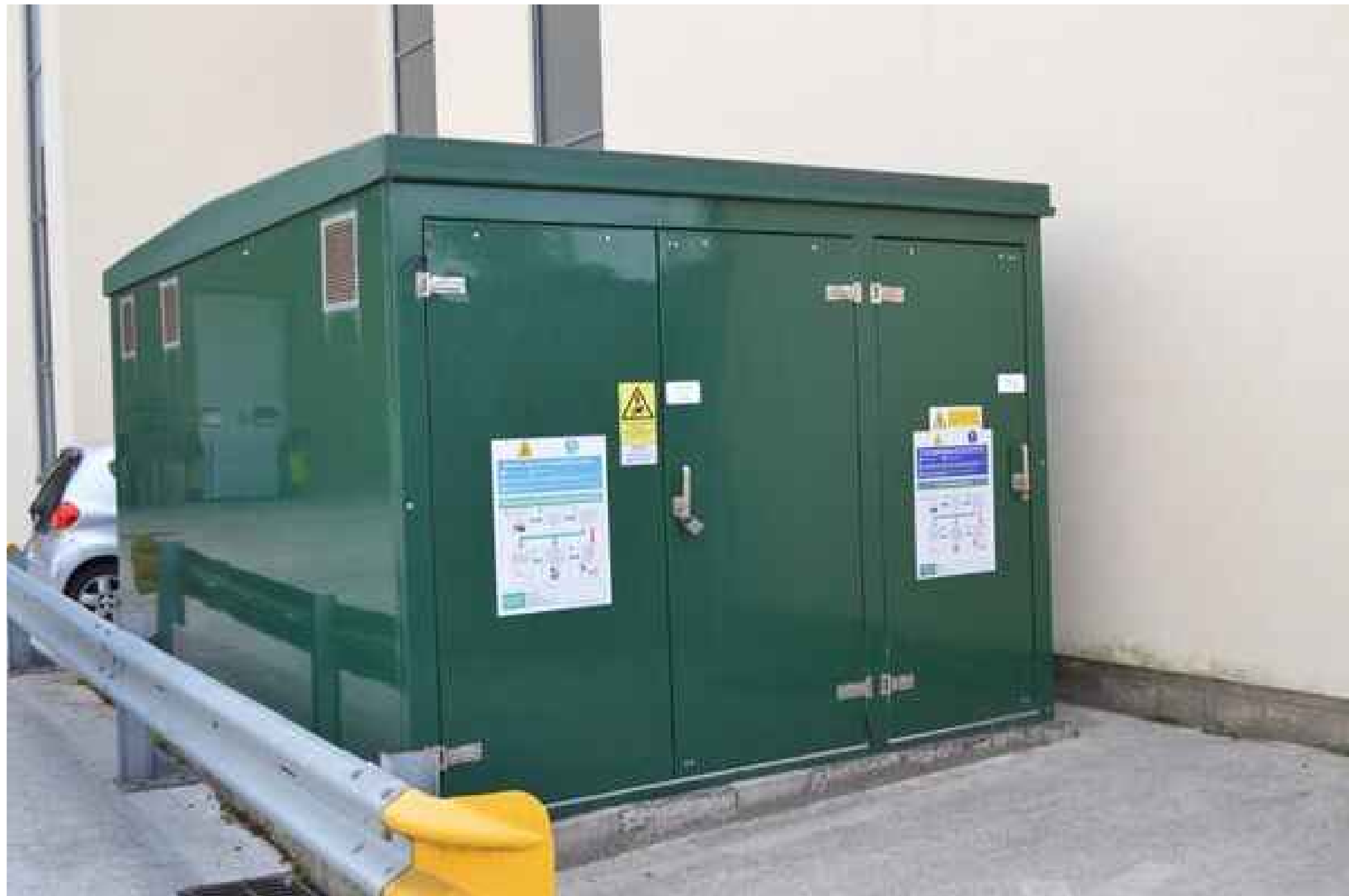
Extract A: Typical glass reinforced plastic housed substation