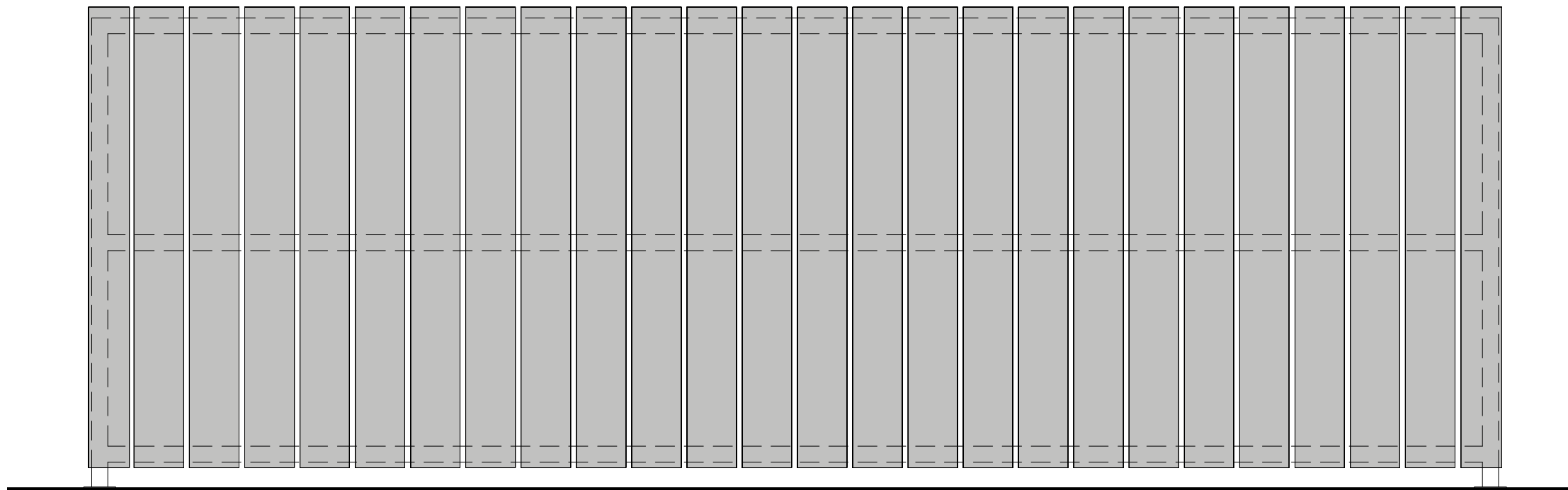
Bin Store Elevation - Scale 1:20