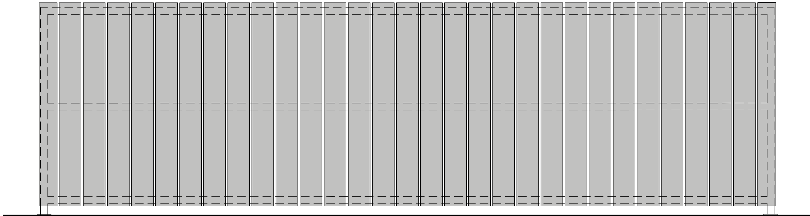
Bin Store Elevation - Scale 1:20