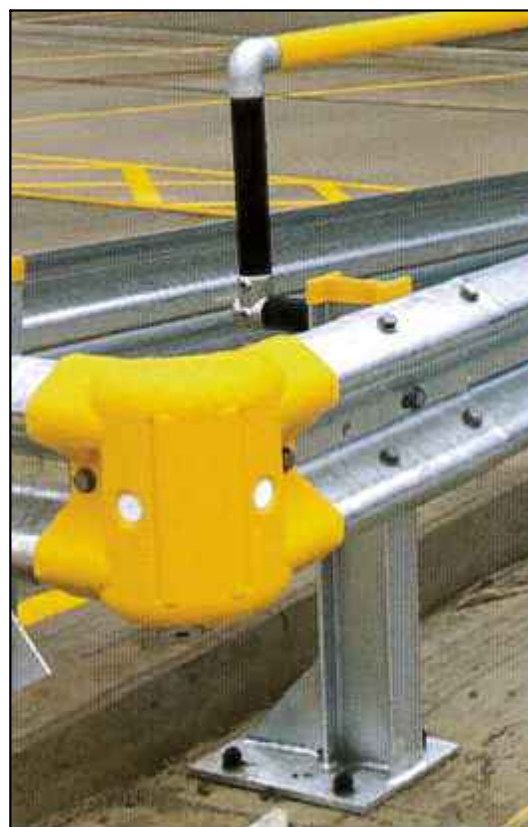
Armco Protective Barriers

Location: HGV parking spaces against vulnerable areas of elevations Finish: Galvanised Steel with end caps and fish tails where required