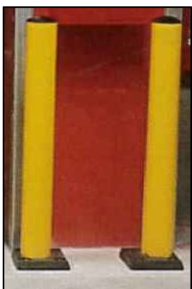
Medium Duty Bollards

Location: Internal areas Range: Brandsafe Impact Safe Medium Duty Protection Post Finish: Steel with Yellow polymer sleeve 225mm diameter x 1500mm high