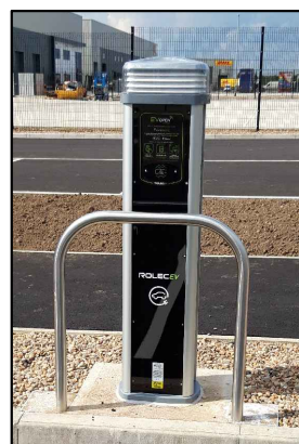
EV Charging Post with Bollard Protection

Location: Lorry parking spaces directly in front of gravel margin. Range: Brandsafe WS-HGV Wheelstop Finish: Steel moulded from recycled truck tyres.