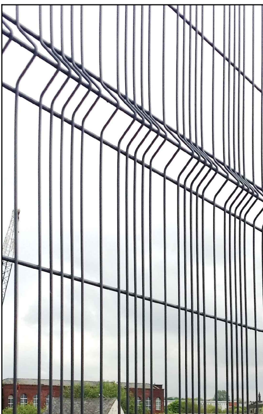
Paladin Fence & Gates

Location: Dock retaining walls Finish: Galvanised Steel Note: Handrail to be secured to top of dockwalls