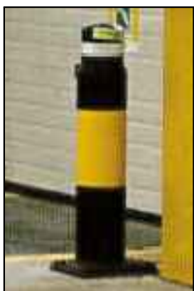
Heavy Duty Bollards

Location: Internal areas Range: Brandsafe Impact Safe Medium Duty Protection Post Finish: Steel with Yellow polymer sleeve 225mm diameter x 1500mm high