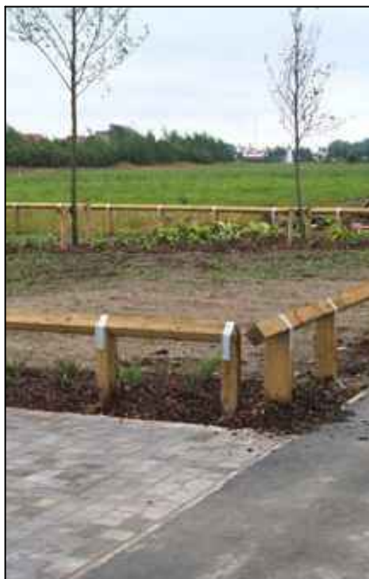
Timber Knee Rail