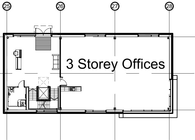
Proposed Building Layout Scale 1:300