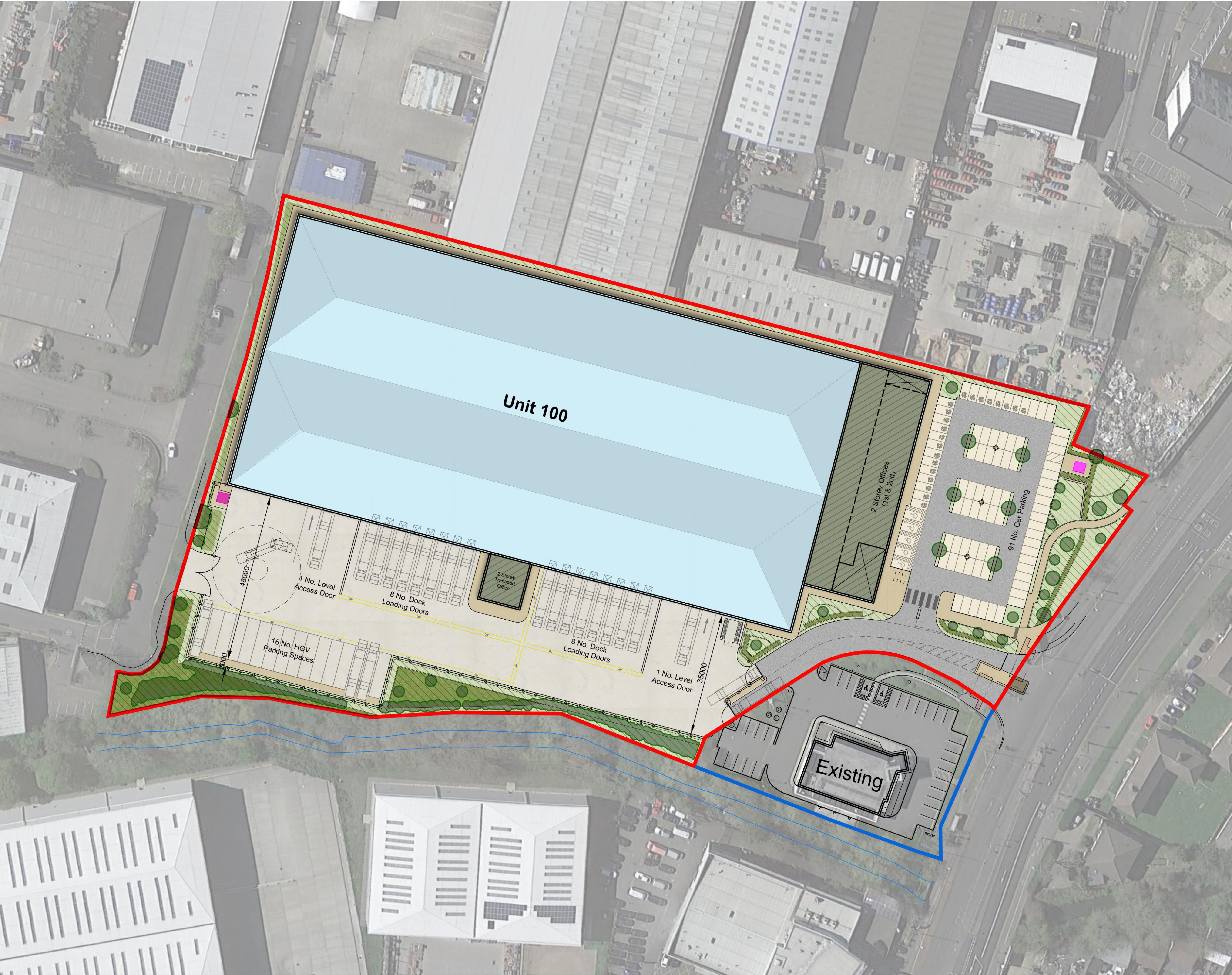
Proposed Site Layout Scale 1:500