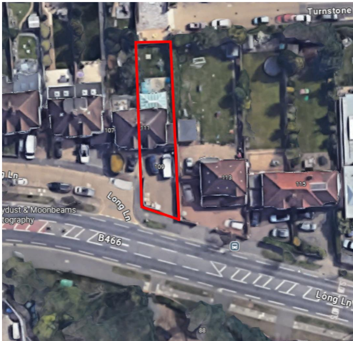
Fig 1: aerial view of the site.

The remaining extension of erection of single-storey side extension and; Erection of second-storey side and rear extension; Erection of side and rear dormers; obscure glazed side windows, stay the same as per approved scheme, reference number 19076/APP/2023/1027, approval date 01-06-2023.