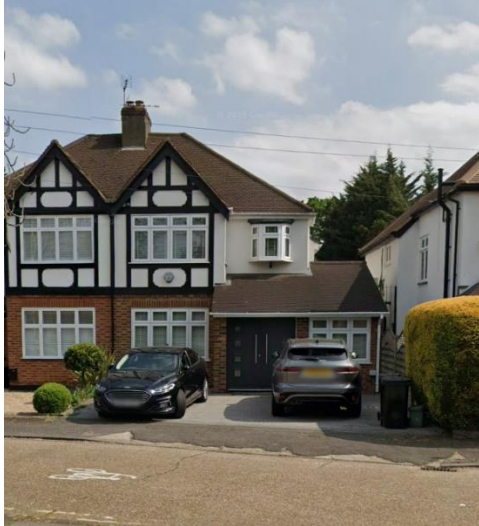
Fig 3: Street view of no.107

Design response – The scale and design front porch is in line with Hillingdon design guideline. A similar porch design can be found at no.107 Long lane (Fig 3)