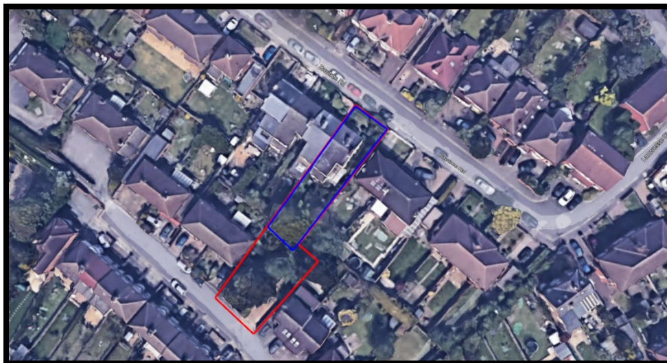
Figure 1: Aerial Image of site with approximate red line boundary denoting property boundary and with blue line denoting area surveyed

Subsequently, this report has been produced, balancing the layout of the proposed development against the competing needs of trees. This report comprises all of the requisite elements of an arboricultural implications assessment, method statement and supporting plans.