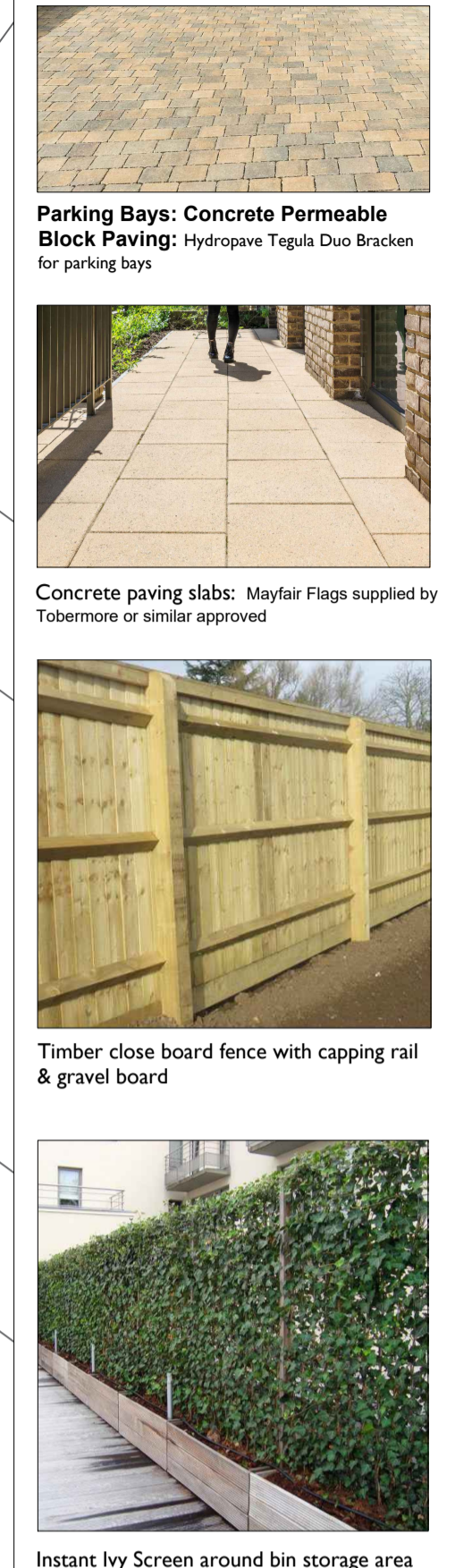
Instant Ivy Screen around bin storage area