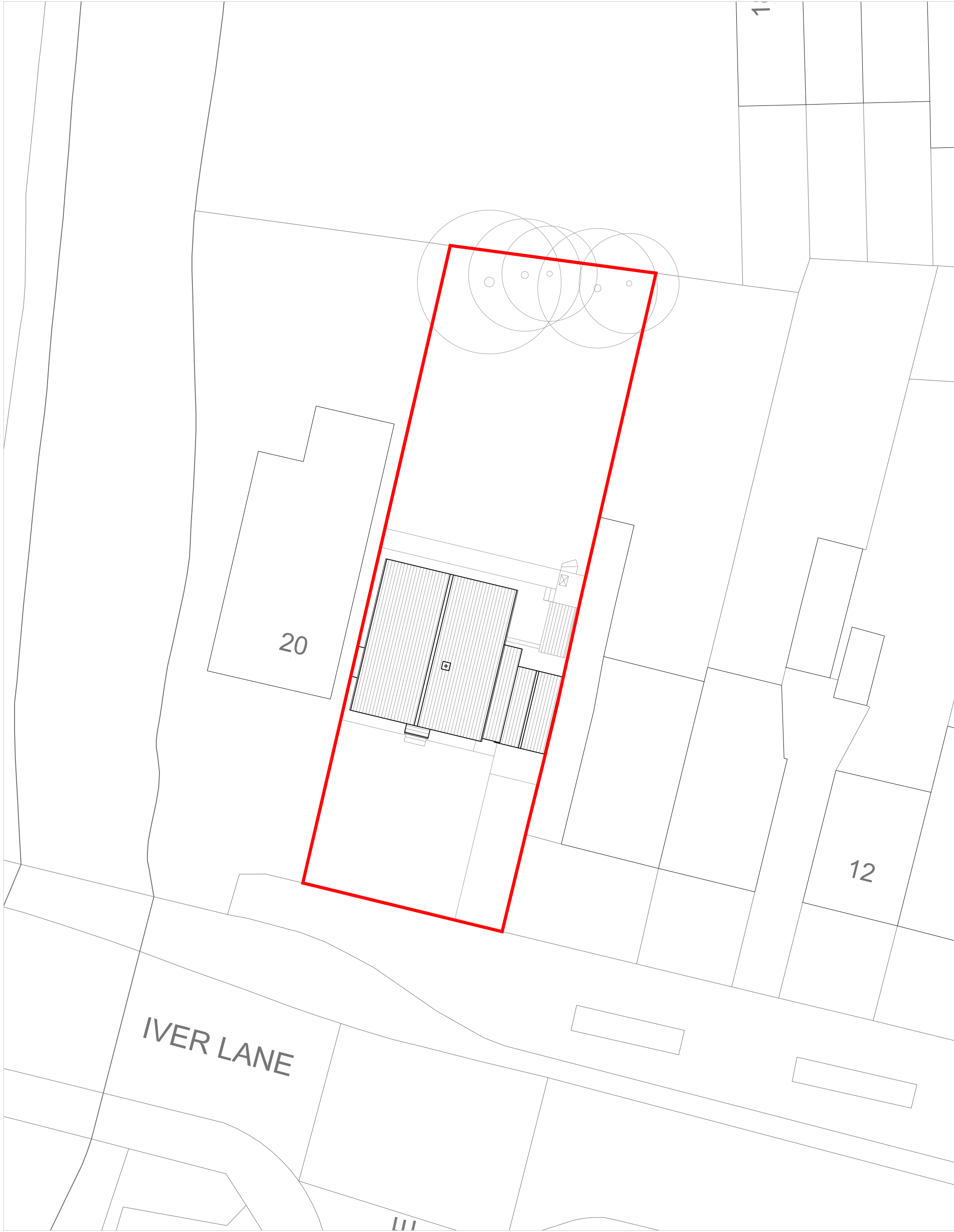
EXISTING SITE PLAN Scale 1:200