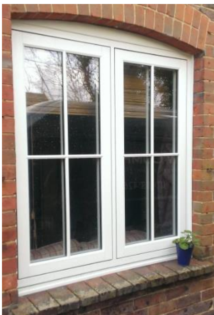
Above Right: UPVC Residence 9 Casement (front dormers only)