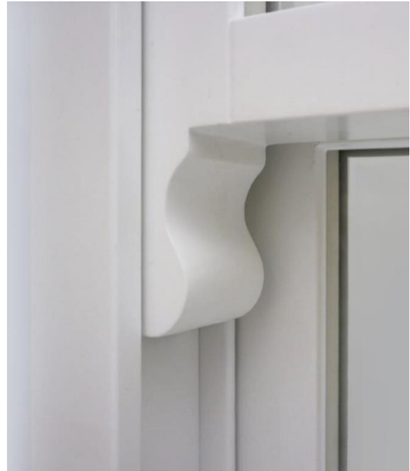
Above: Timber Sliding Sash