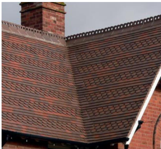
Above Right: Valley Tiles