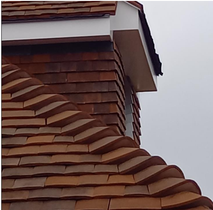
Above left: Bonnet Hip Tiles

Clay Plain Tile by Traditional Clay Roof Tiles Ltd Bonnet Hip, Valley and Half-Round Ridge Tile