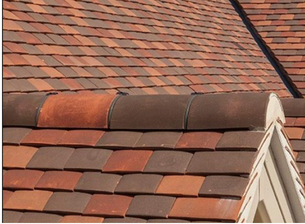
Above left: Half Round Ridge Tile