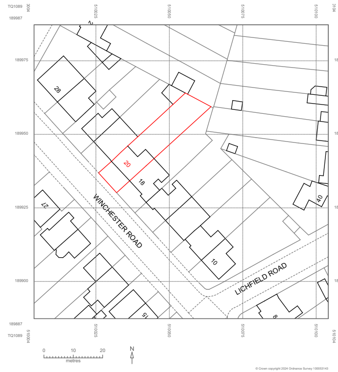
1:1250 Location Plan