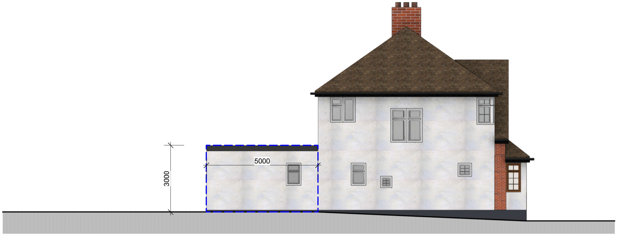
1 01 PROP ELEV SIDE Scale: 1:100