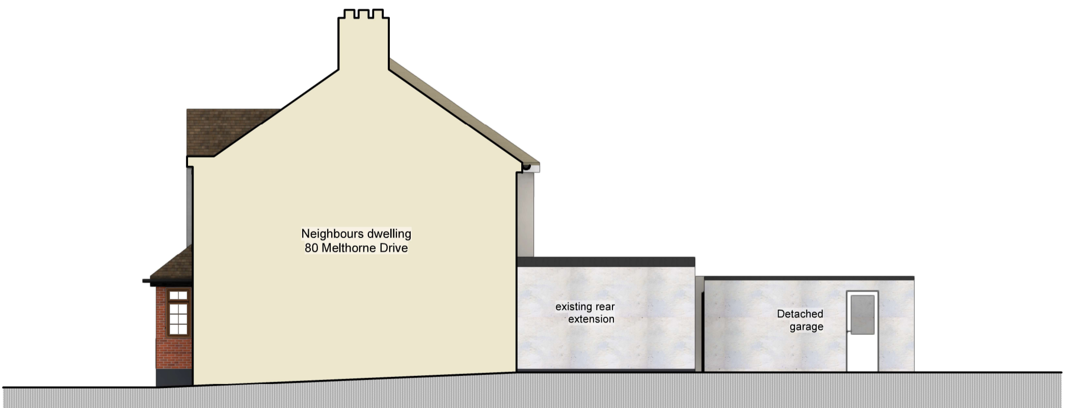
2 02 EXG ELEV SIDE Scale: 1:100