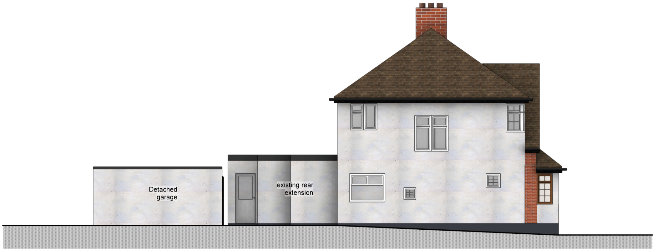
1 01 EXG ELEV SIDE Scale: 1:100