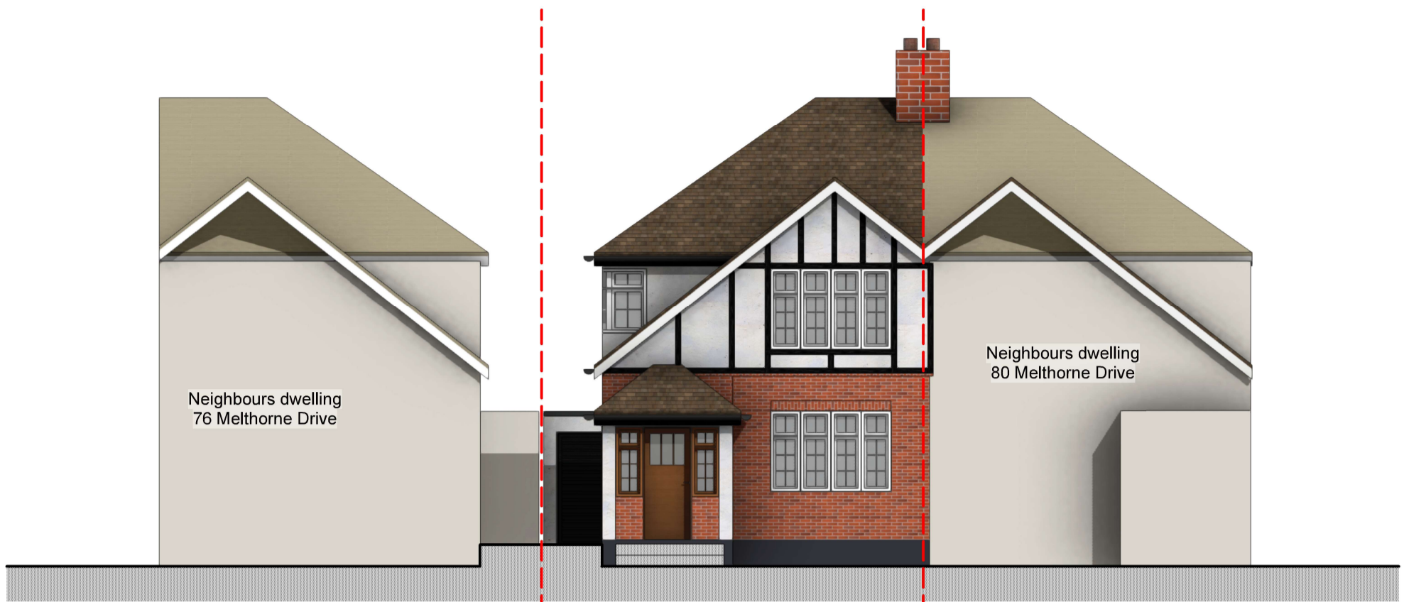
01 01 EXG ELEV FRONT Scale: 1:100