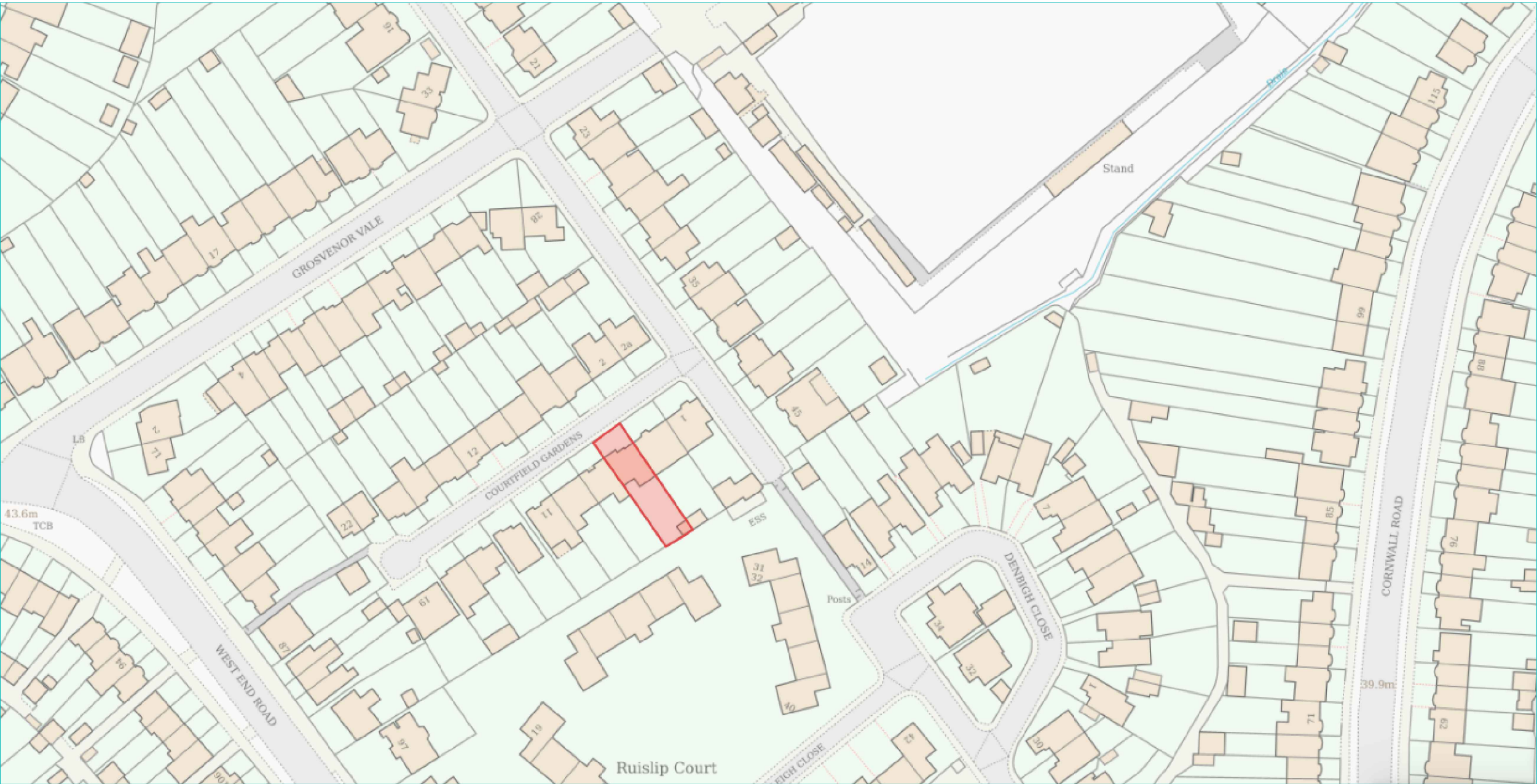
OS MAP 1:1250