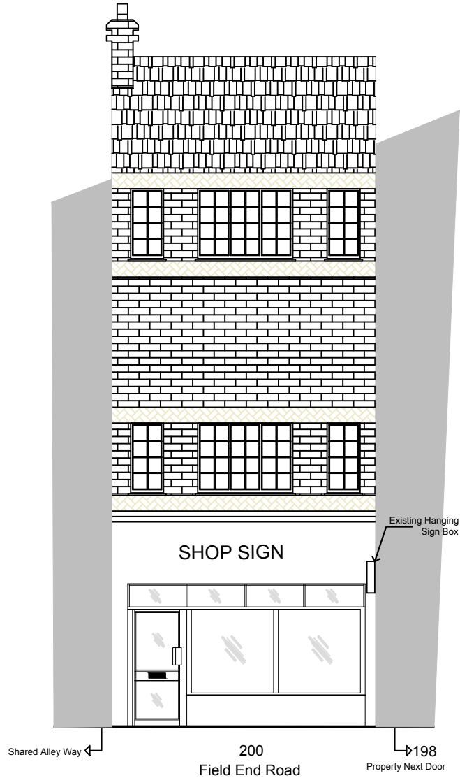
Front Elevation - Existing Facing South