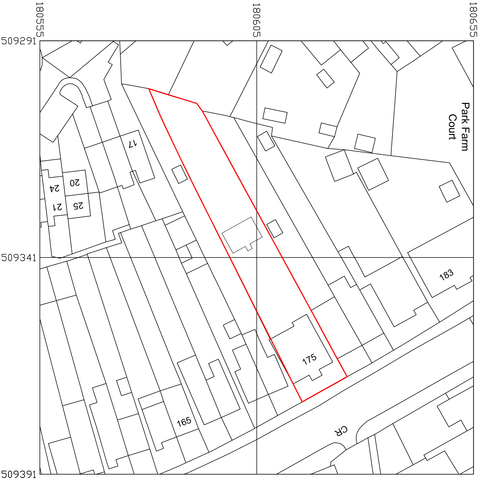
Proposed Block Plan Scale 1:500