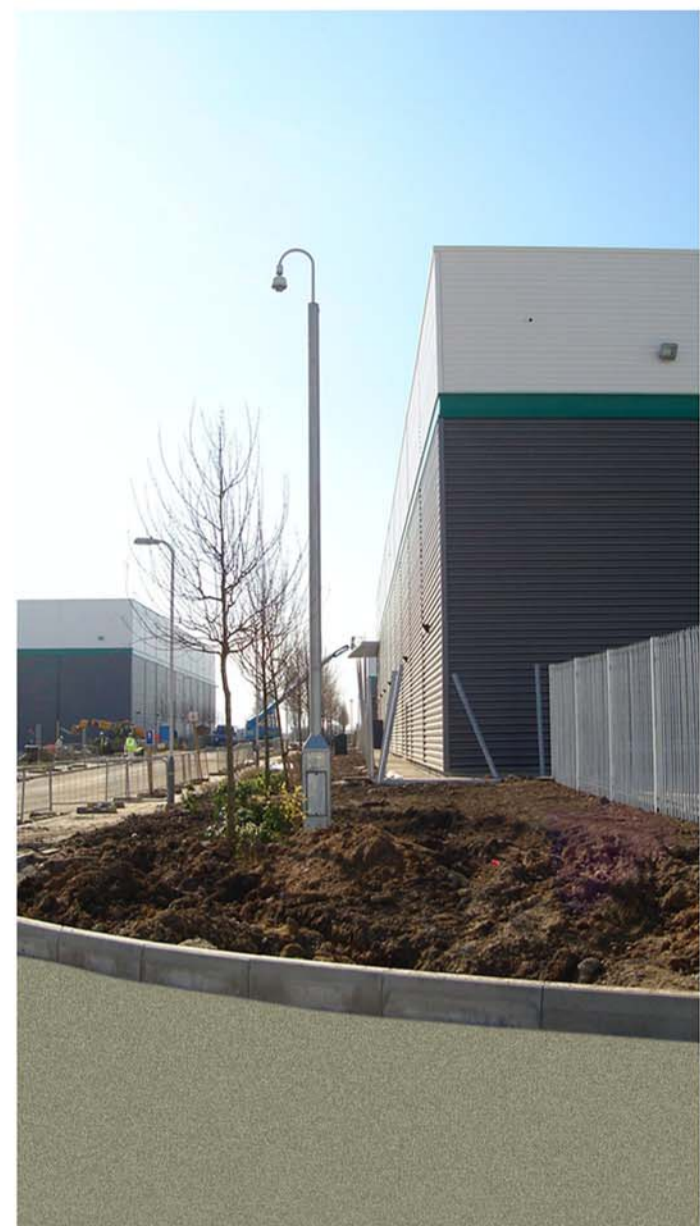
EXISTING CCTV COLUMNS AND CCTV CAMERAS