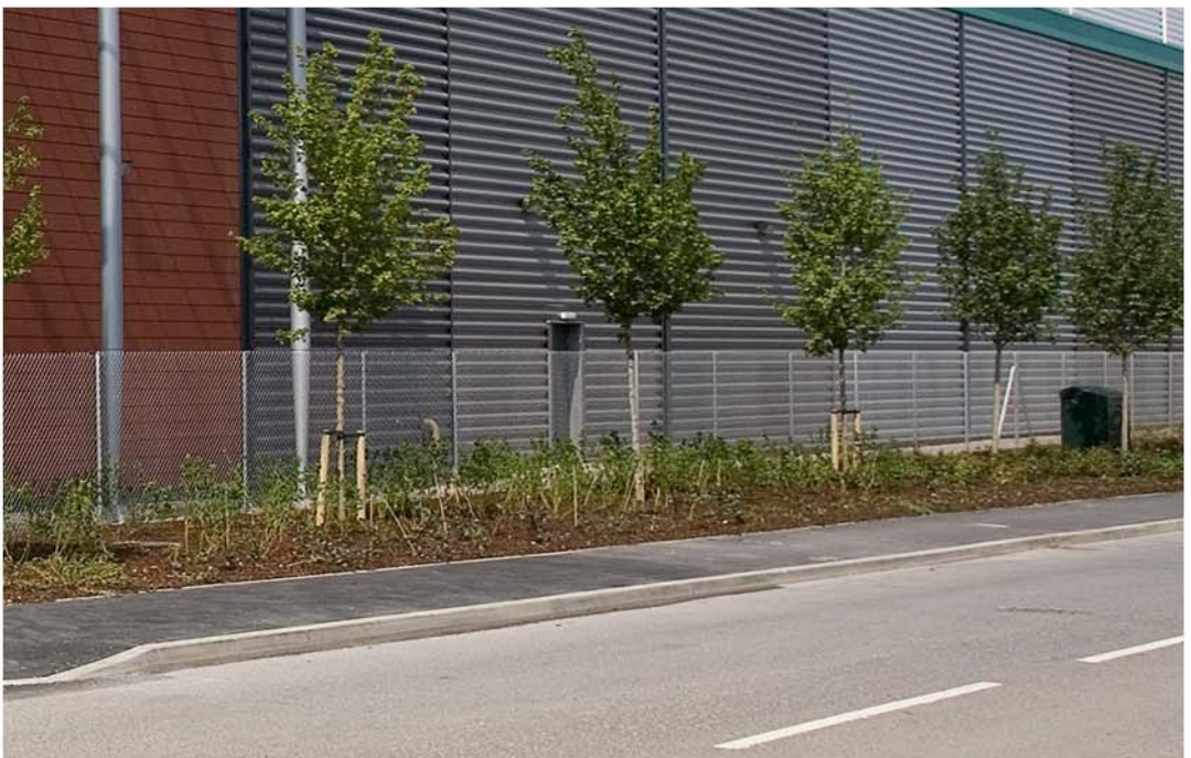
EXAMPLE OF 1.8M CHAIN LINK FENCE AS INSTALLED ON UNIT B AND THROUGHOUT ESTATE