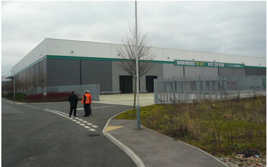
EXAMPLE OF 2.4M PALLISADE FENCE AS INSTALLED ON UNIT B AND THROUGHOUT THE ESTATE