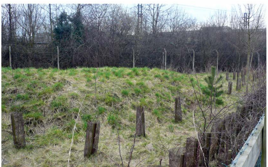
EXISTING 3M HIGH PERIMETER FENCE