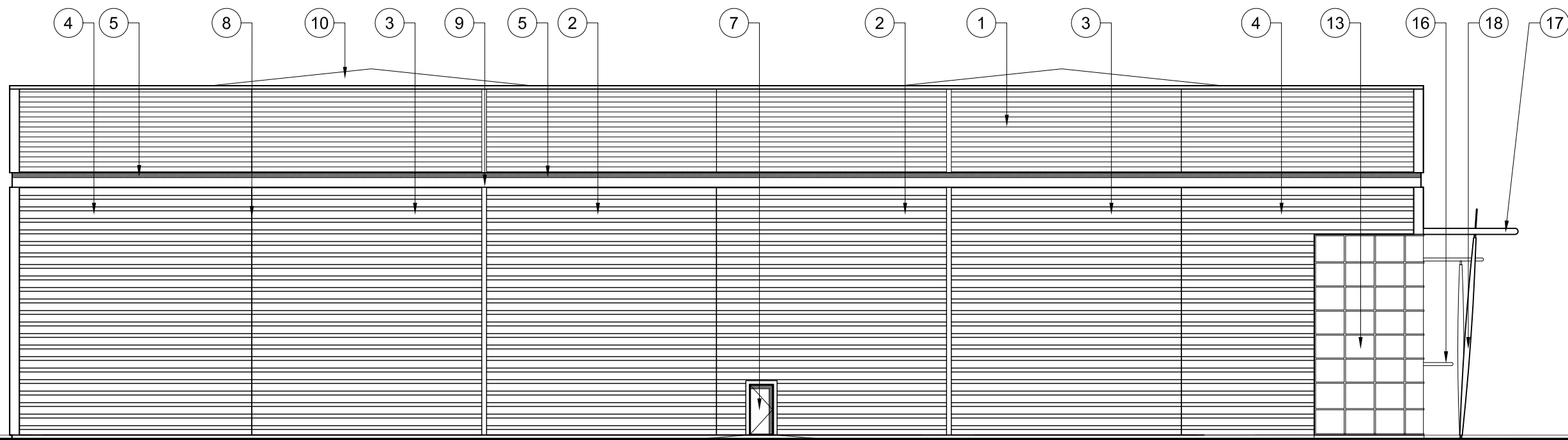
02 104 UNIT C - WEST ELEVATION 1:200