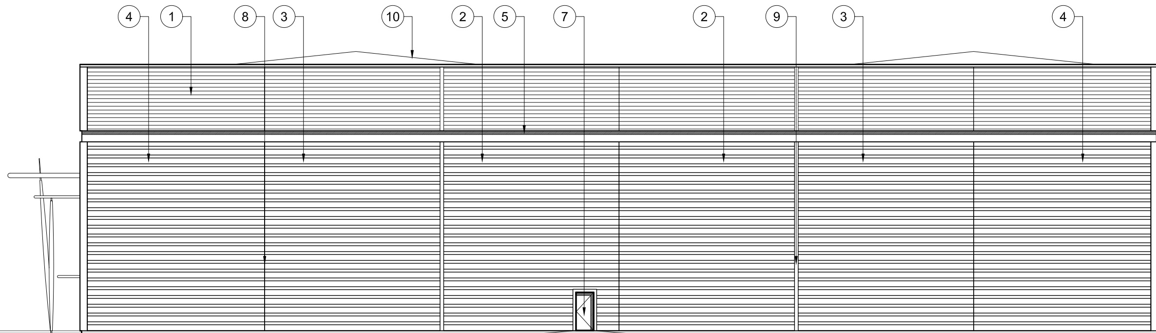
04 104 UNIT C - EAST ELEVATION 1:200