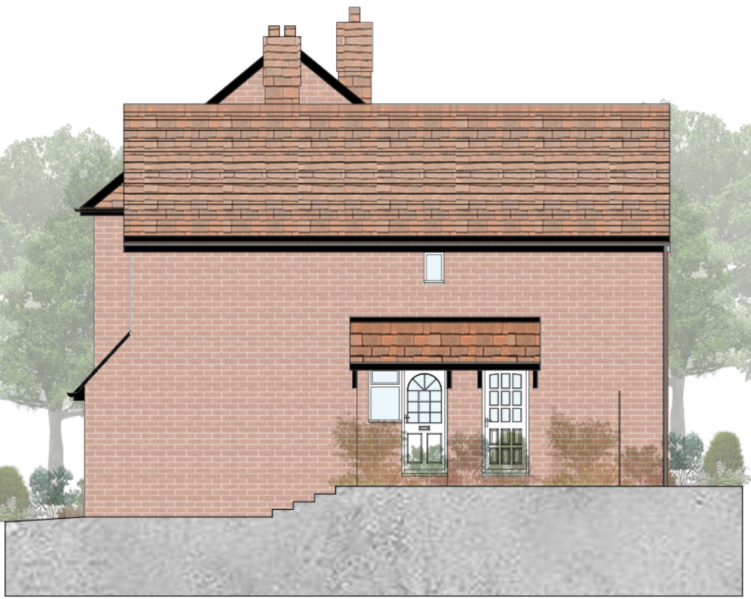
SIDE ELEVATION_ AS EXISTING Scale 1:100