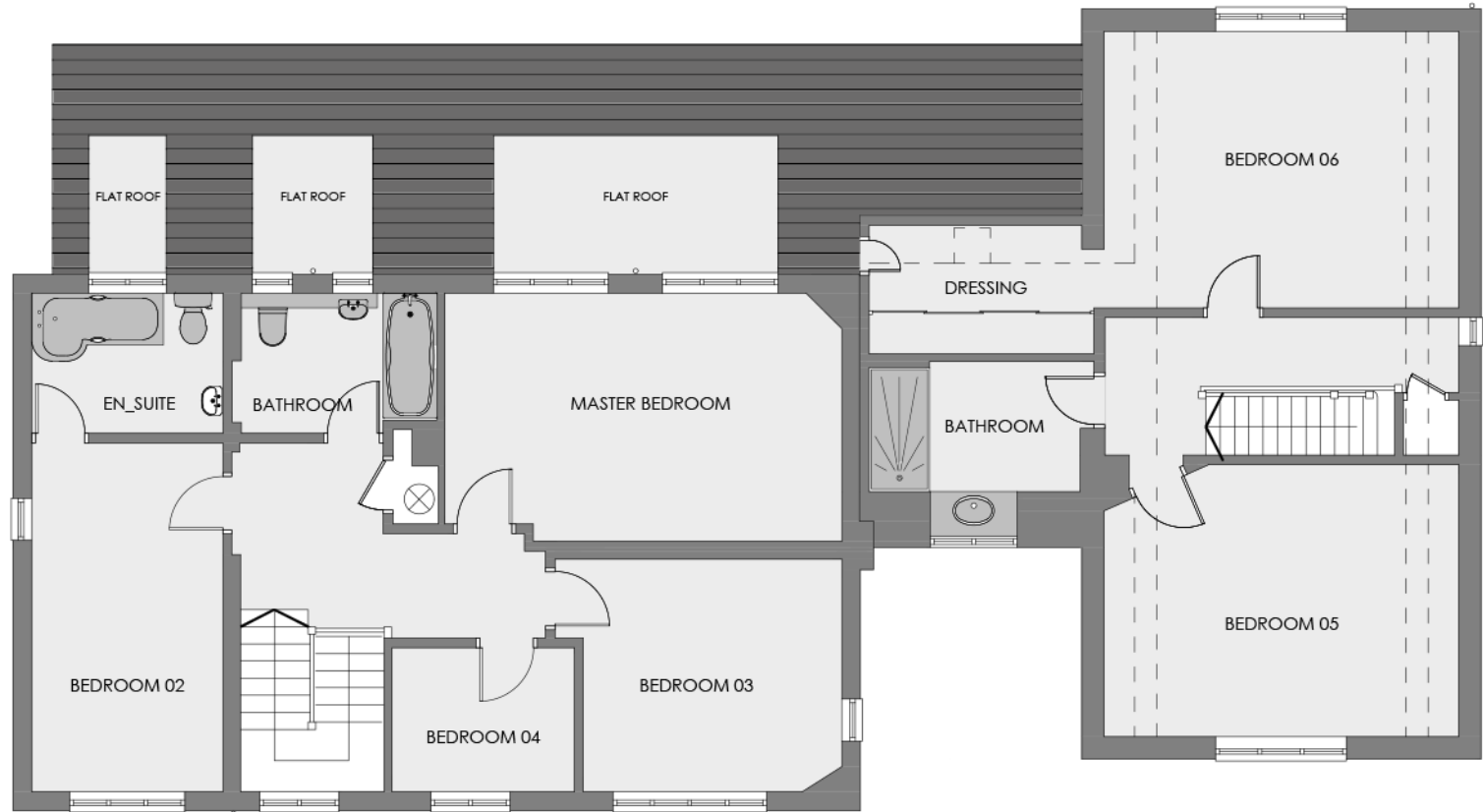
FIRST FLOOR PLAN_ AS EXISTING Scale 1:100