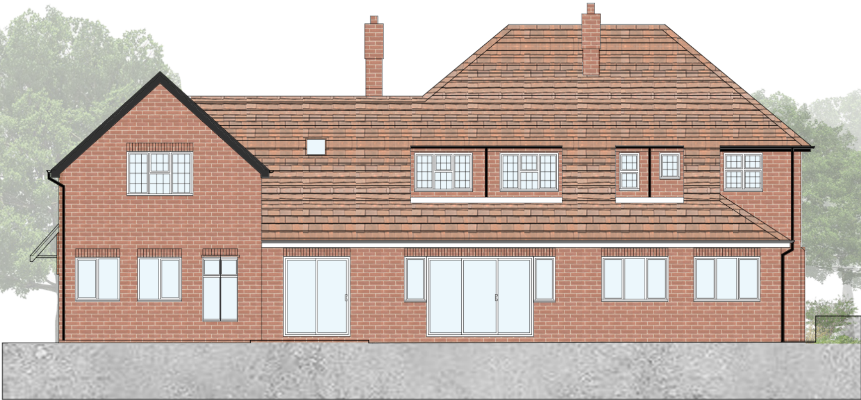
REAR ELEVATION_ AS EXISTING Scale 1:100