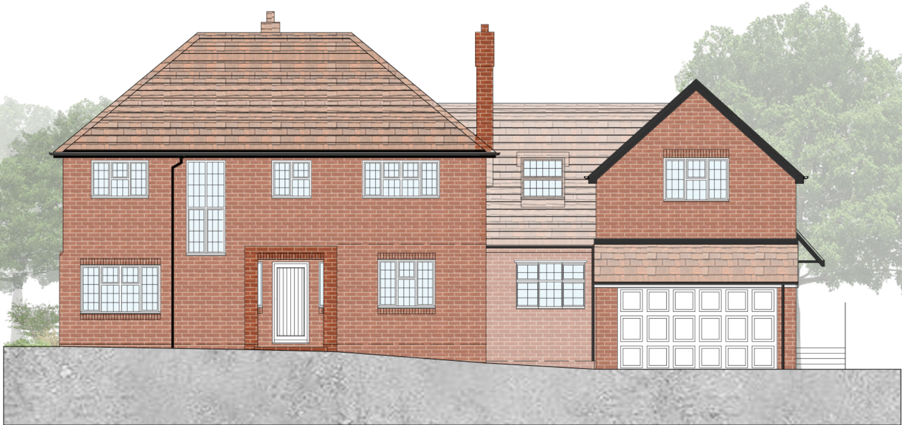
FRONT ELEVATION_ AS EXISTING Scale 1:100