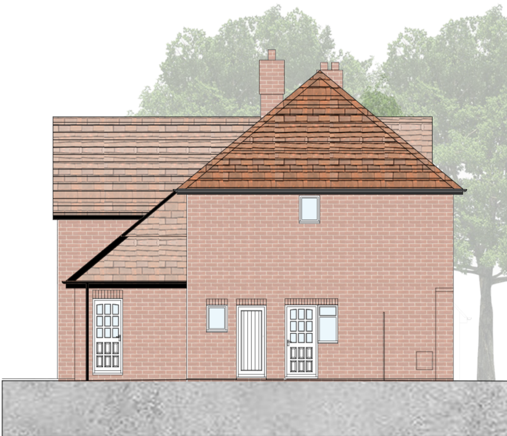
SIDE ELEVATION_ AS EXISTING Scale 1:100