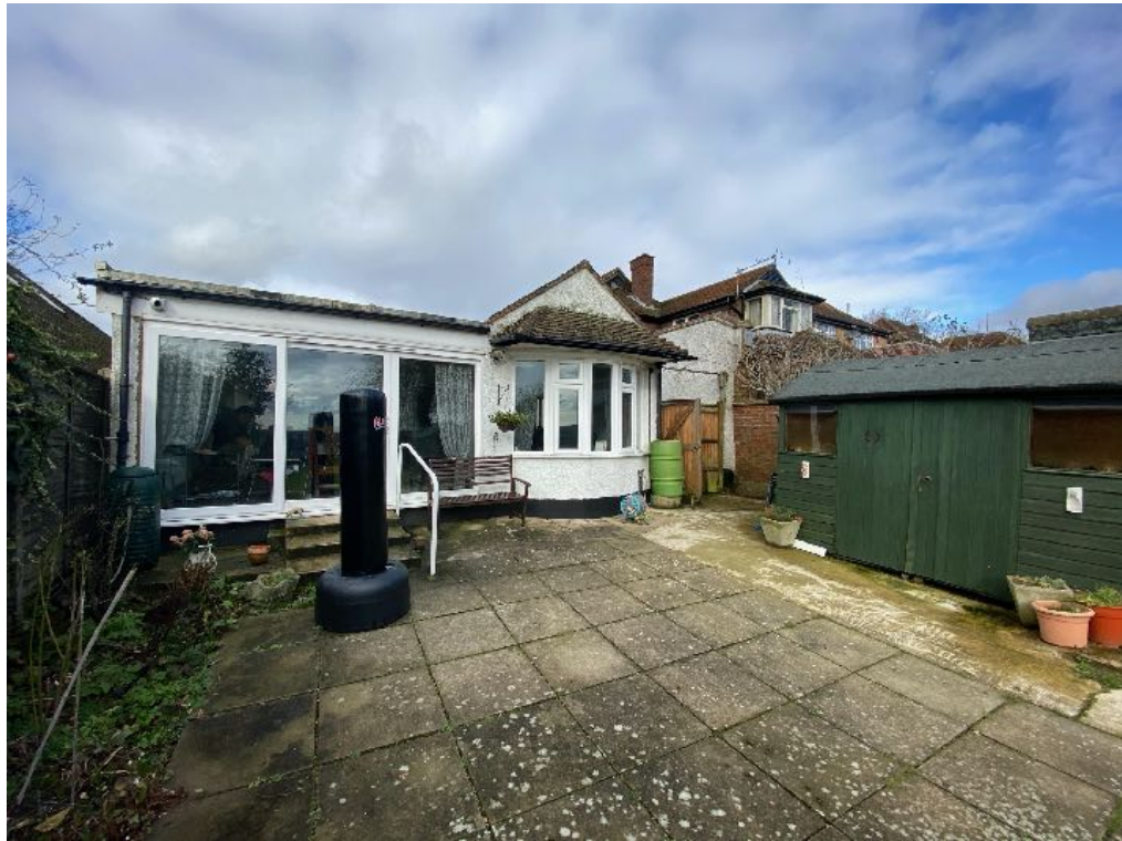
10. View looking North towards the rear of property No.268 Northwood Road showing the patio area, shed and neighbouring property No.270