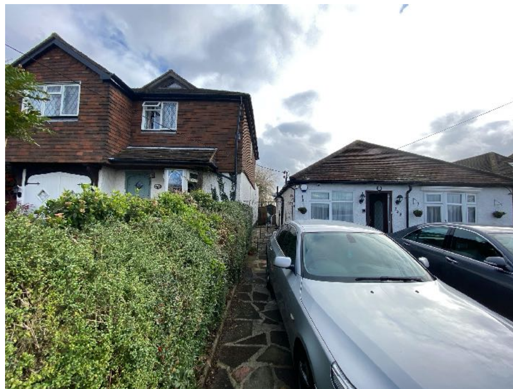
5. View looking South-East, towards the front of property No. 268 Northwood Road showing the boundary and double storey neighbouring property No. 270.