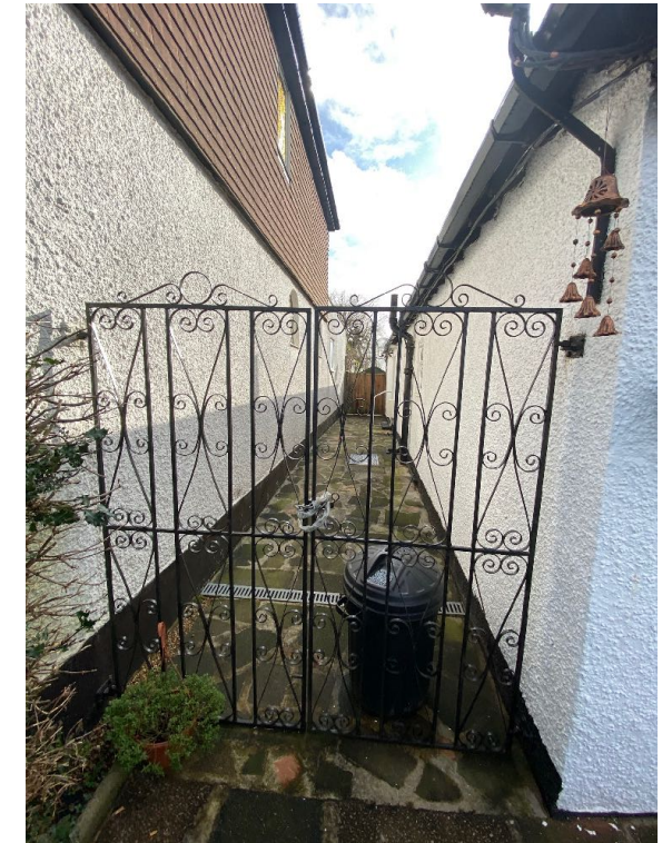
3. View looking South-East towards the side access of of property No.268 Northwood Road.