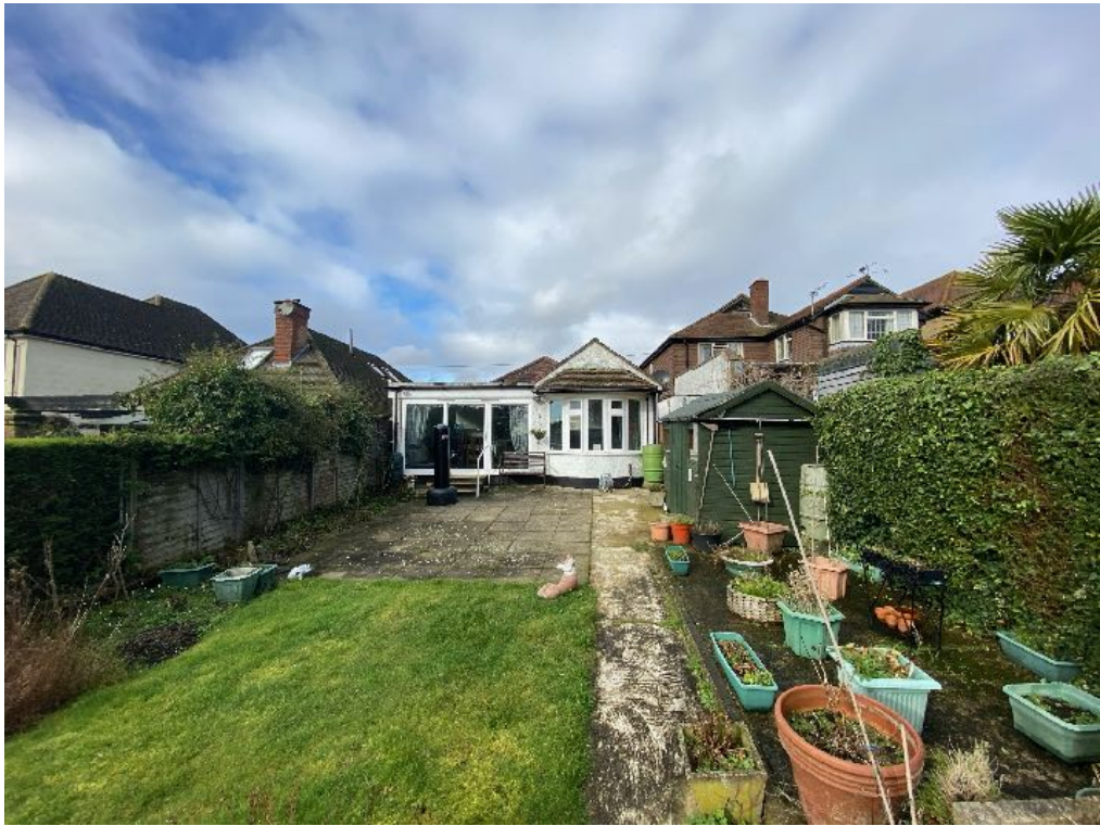
9. View looking North-West towards the rear of property No.268 Northwood Road showing the patio area, garden and neighbouring properties No.266 and 270 within context.