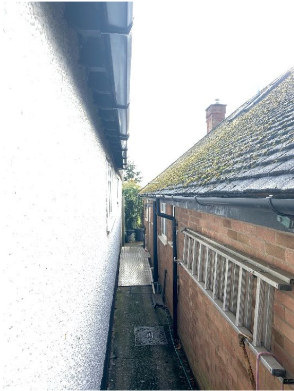
6. View looking South-East towards the side of property No.268 Northwood Road, showing side access and neighbouring property No. 266