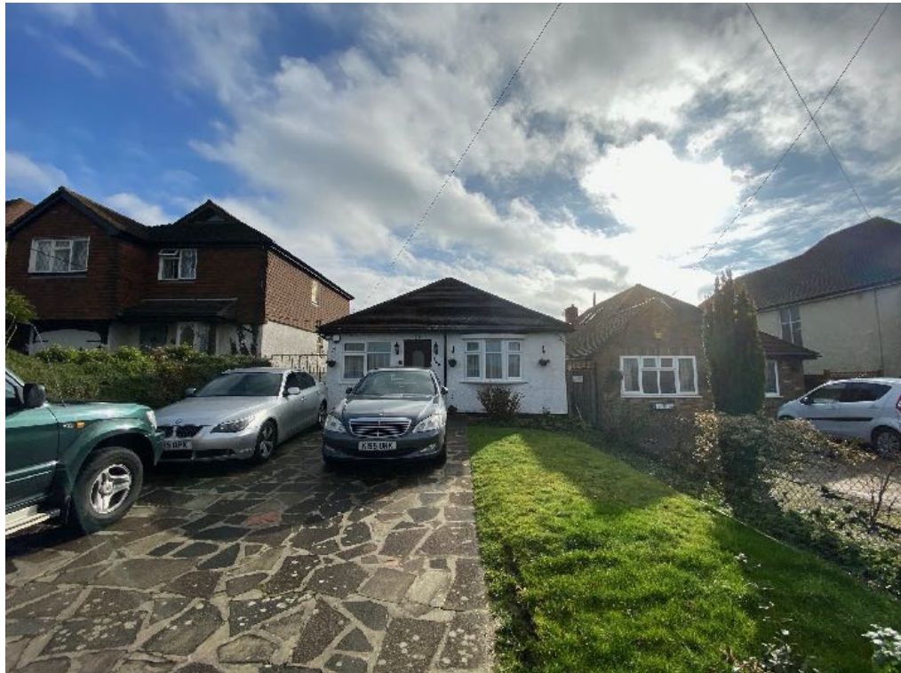
1. View looking South-East towards the front of the property No. 268 Northwood Road showing the driveway, boundaries and neighbouring properties No. 270 & 266 Northwood Road. Note level change