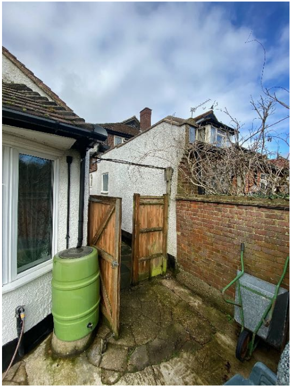
8. View looking North towards the rear of property No.268 Northwood Road showing the patio area and neighbouring double storey property No.270.