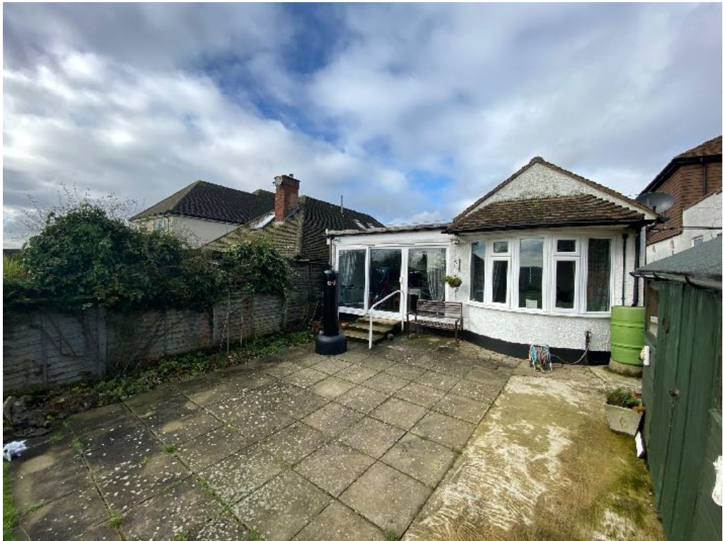
11. View looking West towards the rear of the property No. 268 Northwood Road showing the patio area and neighbouring property No.266