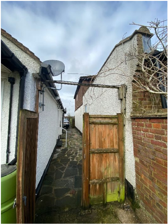
7. View looking North-West towards the side of property No.268 Northwood Road showing gates from the rear with neighbouring property No.270 to the right.