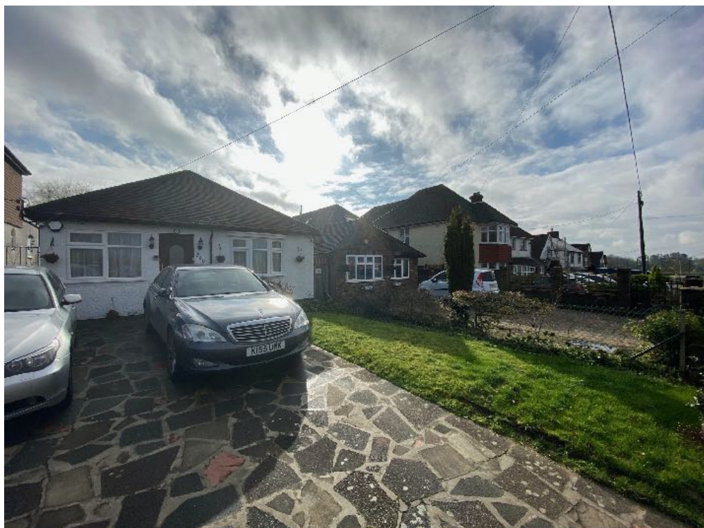
4. View looking South towards the front of the property No.268 Northwood Road showing the driveway and neighbouring property No.266