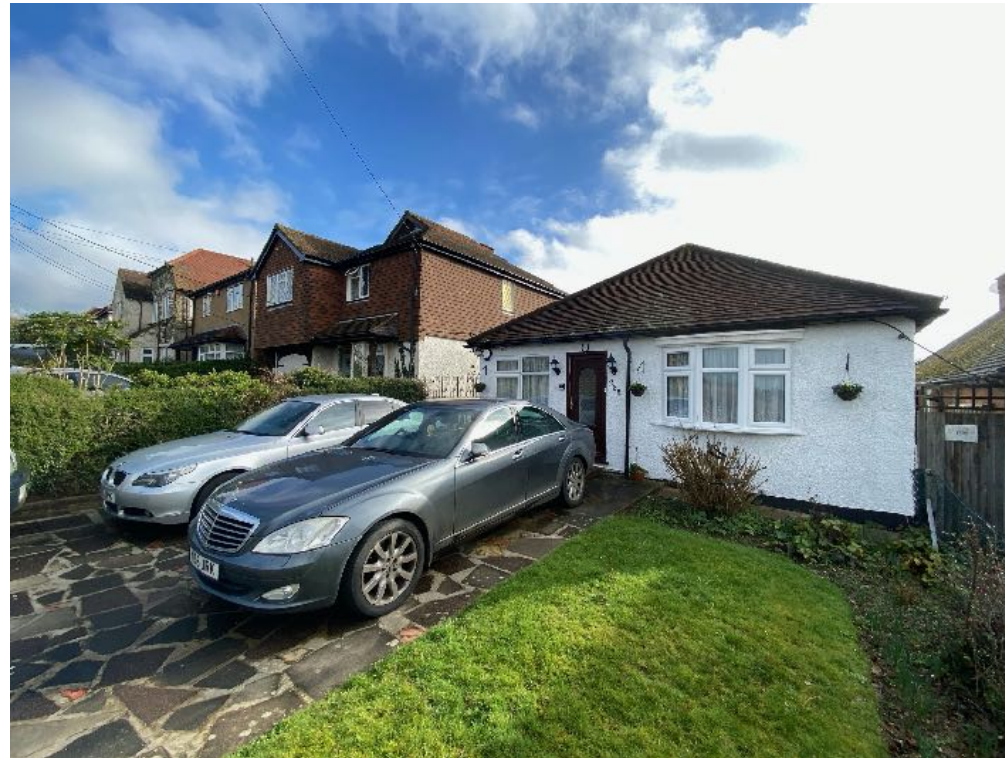
2. View looking North-East, towards the front of property No. 268 Northwood Road showing the the driveway and double storey neighbouring property No.270