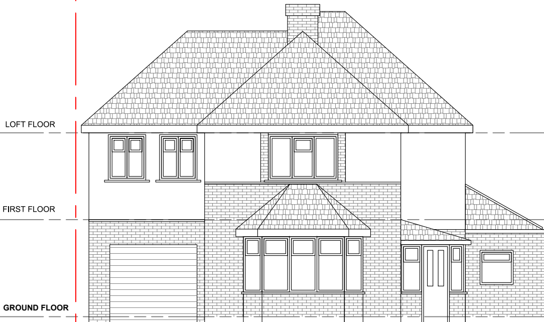
FRONT ELEVATION-NO CHANGE PROPOSED