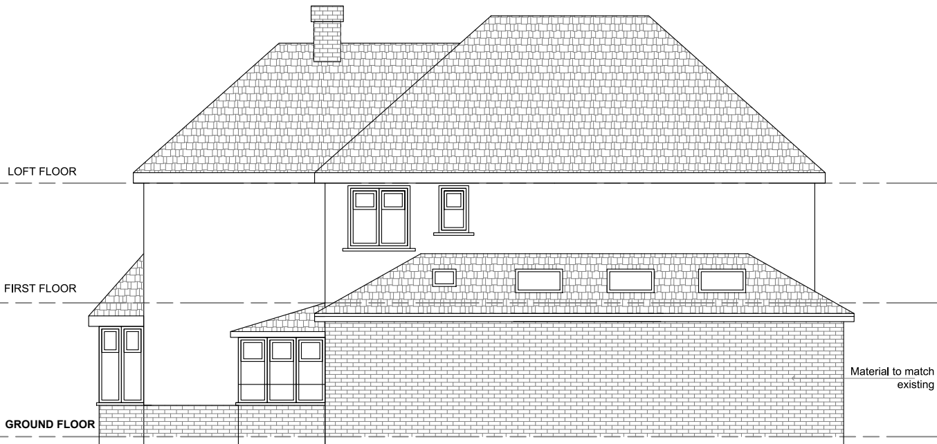
RIGHT HAND SIDE ELEVATION-PROPOSED