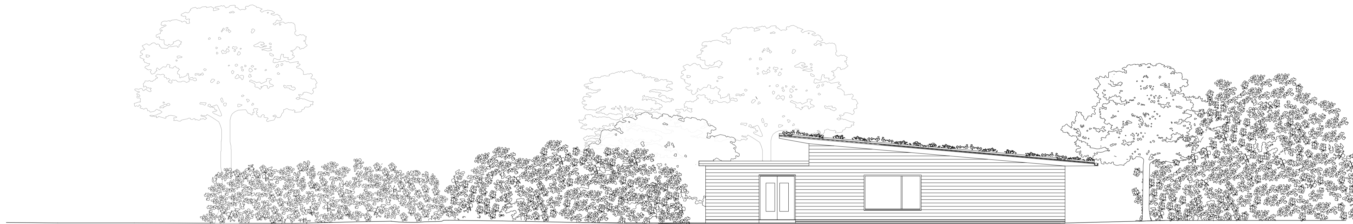
Existing Elevation facing the Playing Field - unaltered.