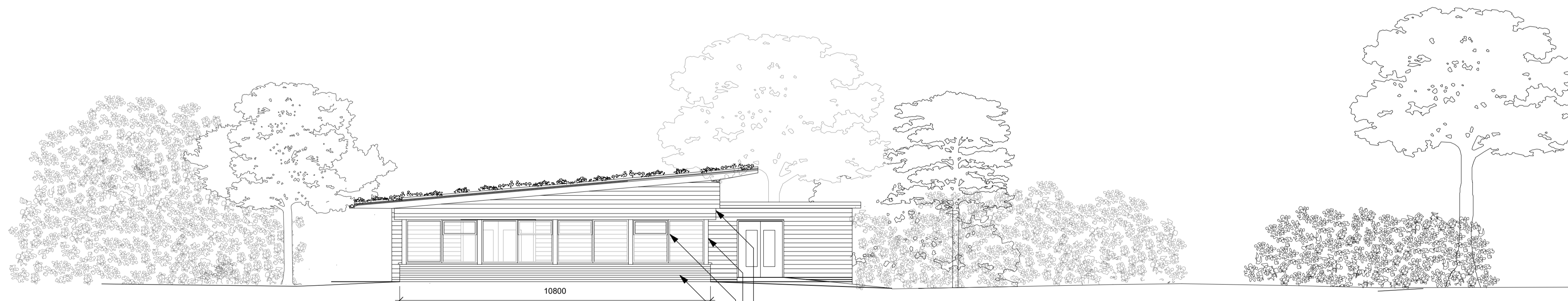
Proposed Elevation facing the Forest Schools Area showing new Conservatory style covered play area.