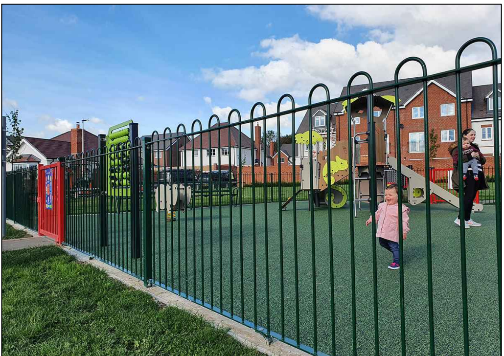
Playground fencing, bow top railing to EN1176