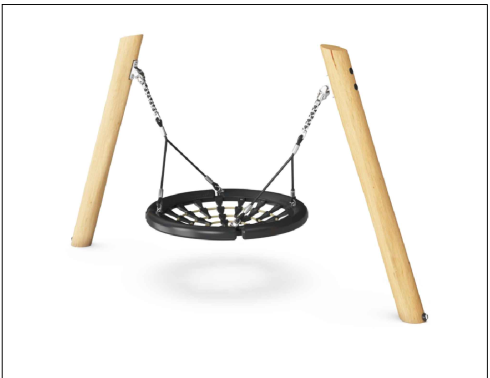
5. Little Spider seat swing - Kompan ref: NRO920