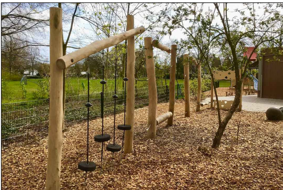
2. Agility 4 trail, balance beams, steps and net - Kompan ref: NRO863