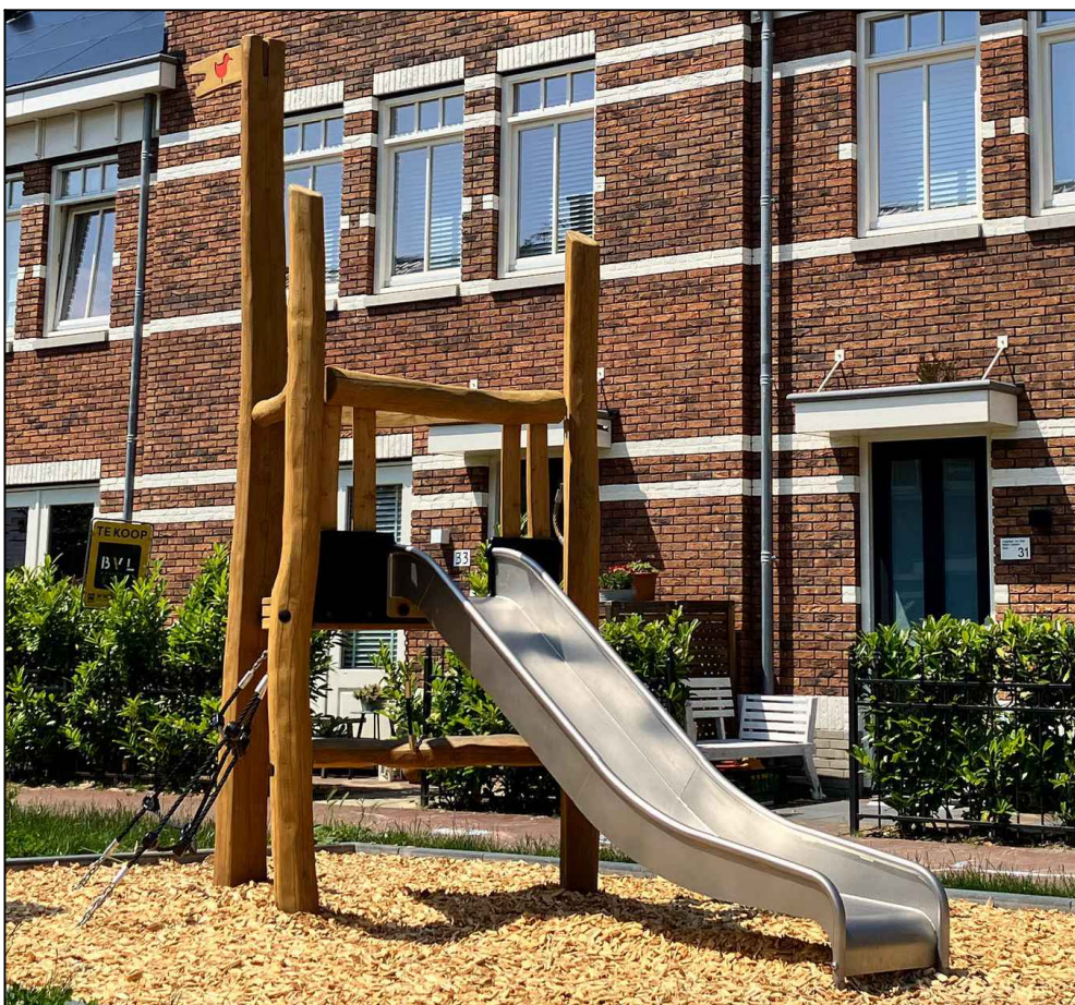
1. Tower with slide - Kompan ref: NRO1003

Play boulders to be supplied by CED Stone or equivalent and approved. Naturally rounded and slip resistant with no cracks or fizzures. Contractor to submit photos for approval prior to ordering. Max finished height above ground 600mm. Installed with correct gaps to meet BS EN 1176. Sizes: minimum diameter 600mm