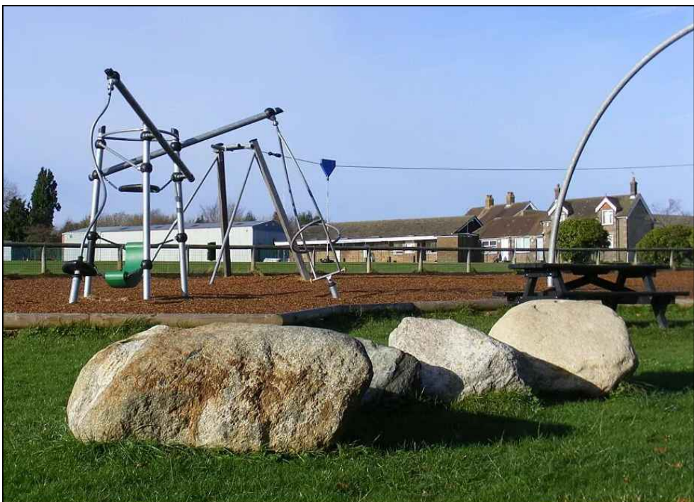
6. Play boulders