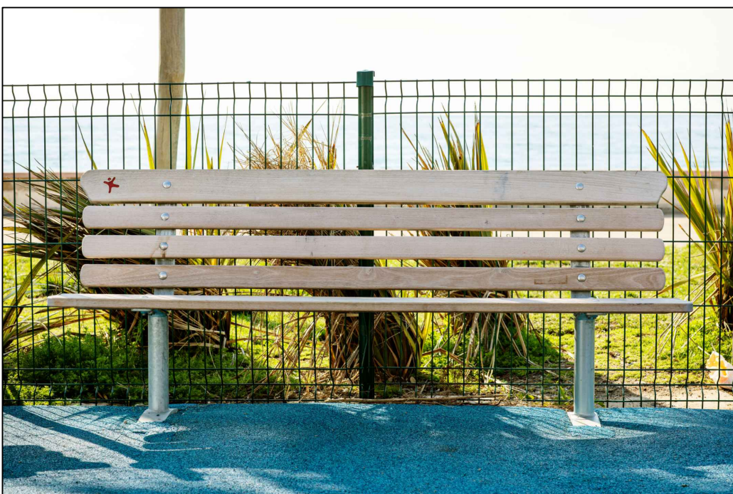
Seat - Kompan ref: NRO213