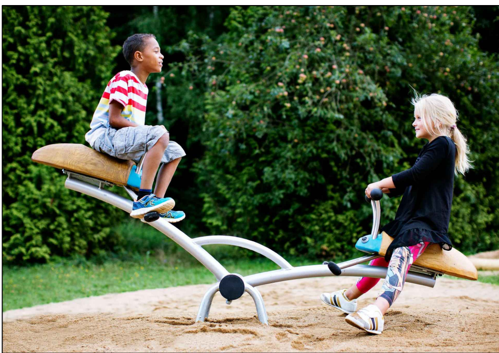
3. Forest bugs see-saw - Kompan ref: NRO117