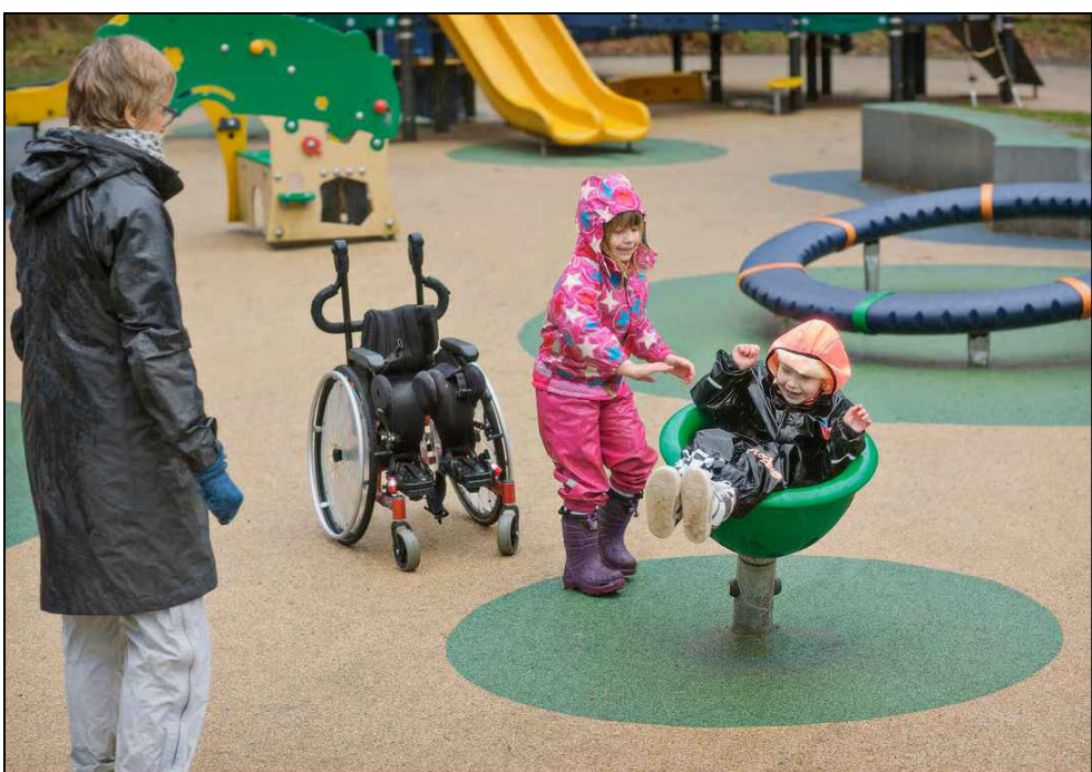
4. Spinner bowl carousel - Kompan ref: ELE400024