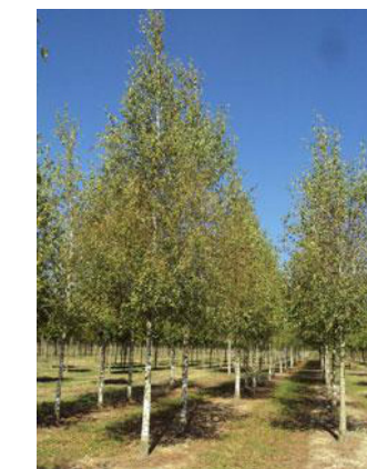
Betula pendula 'Obelisk'