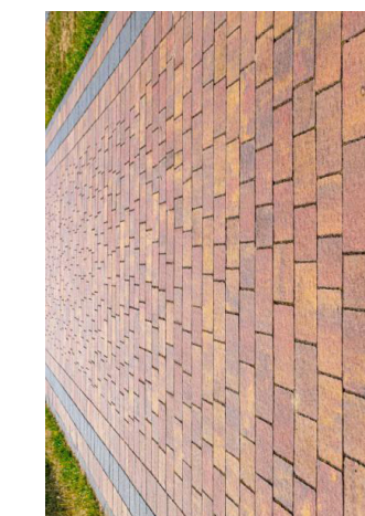
Red brick pathway