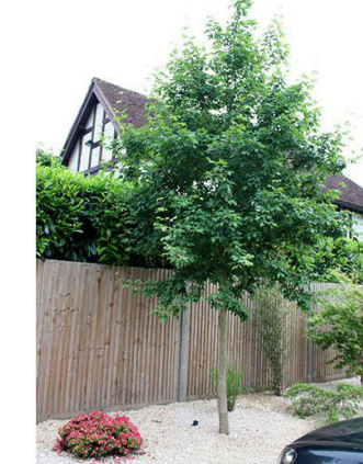
Acer campestre 'Elegant'