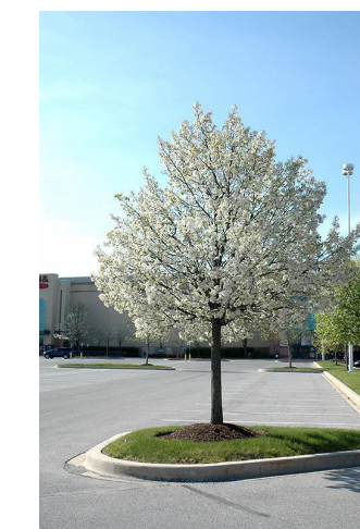
Pyrus calleryana 'Chanticleer'