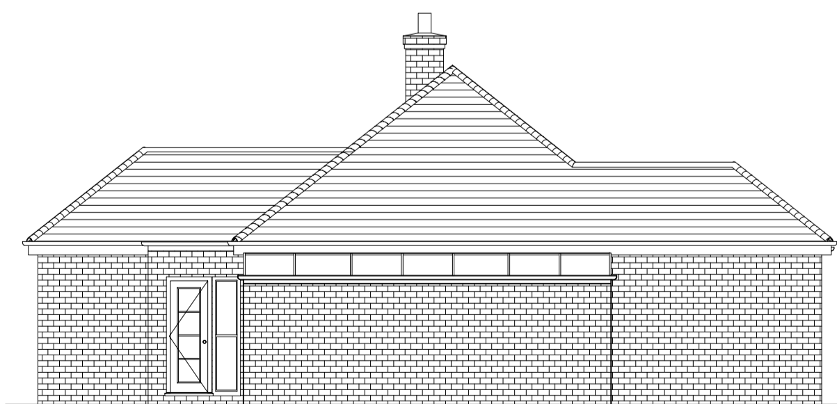
Existing Left Side Elevation