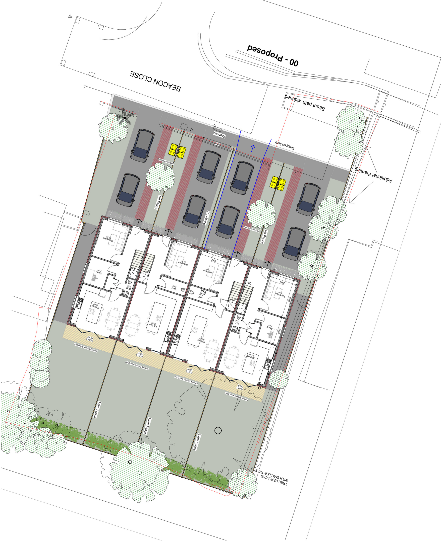
Site with proposed 1 : 200