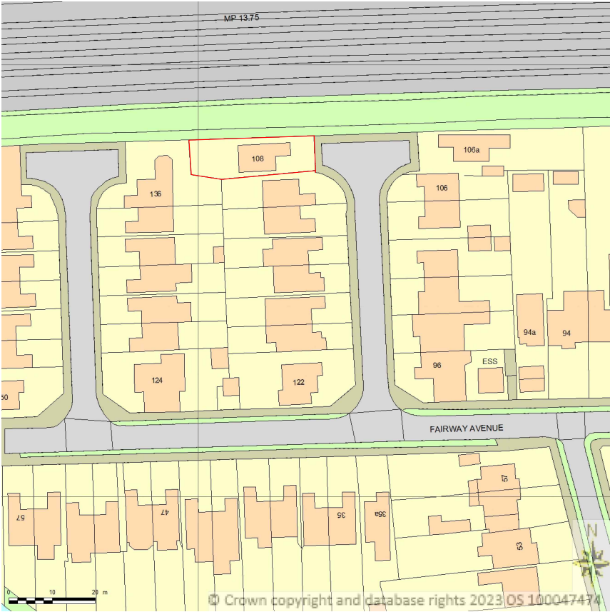
Location Plan @ 1:1250