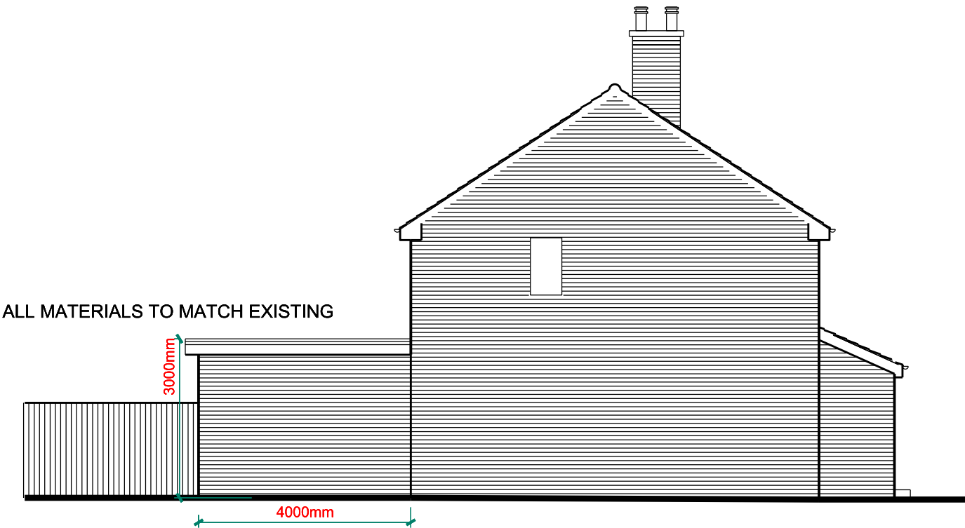
02 PROPOSED SIDE ELEVATION SCALE 1:100